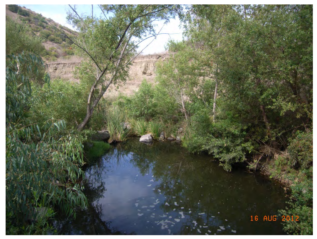
Photo 18 – Looking D/S along Sulphur Creek between Aliso Creek Confluence and Ex. RCB underneath Alicia Parkway