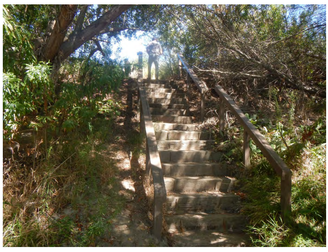
Photo 19 – Pedestrian Streambed Access Point to be Replaced (Approximately 650' D/S of Sulphur Creek Confluence)