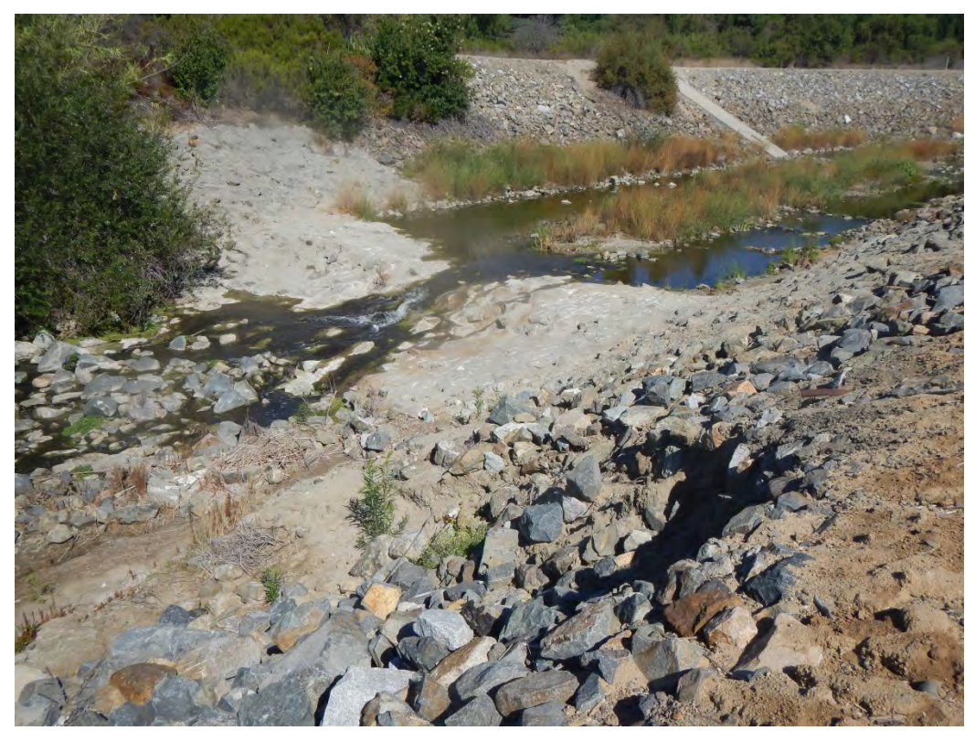
Photo 13 – Grouted Riprap Drop Structure to be Removed, Located D/S of Aliso Creek Road