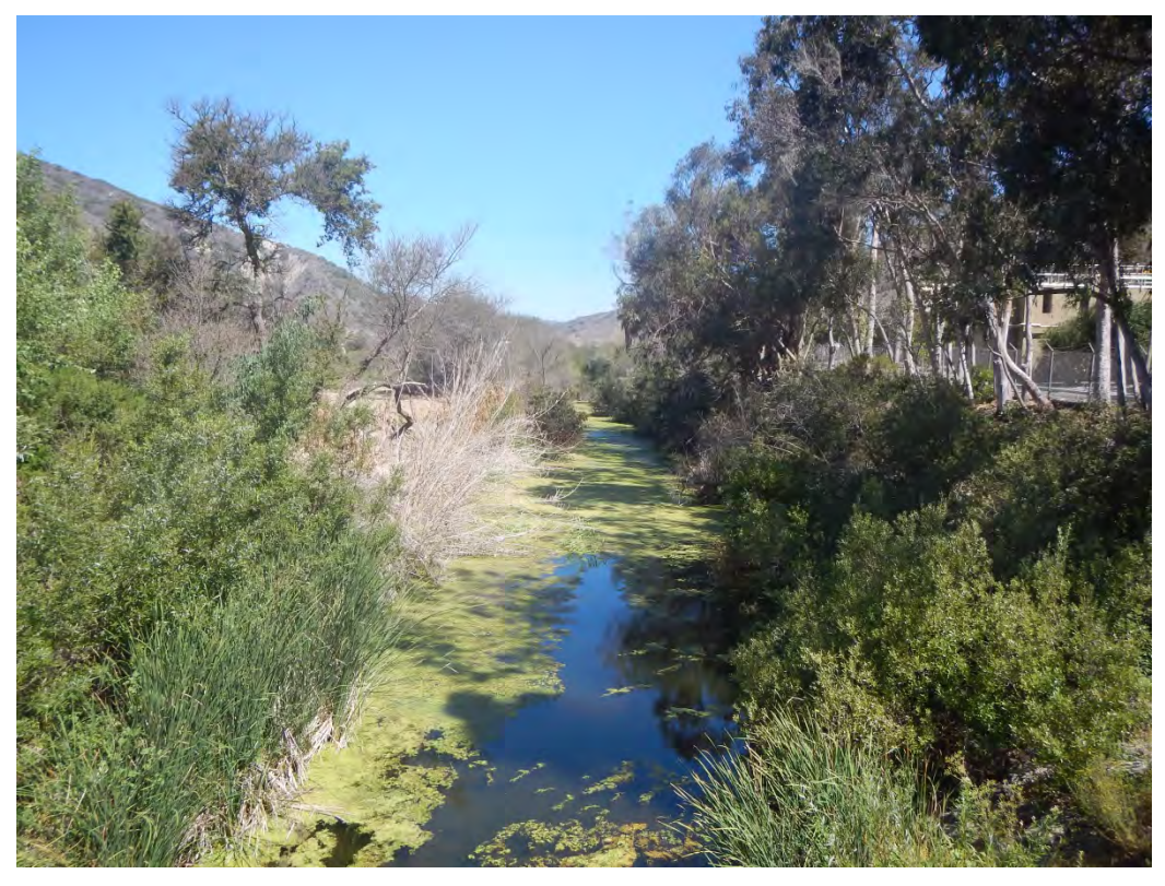
Photo 25 – Looking U/S along Aliso Creek from SOCWA Coastal Treatment Plant Bridge