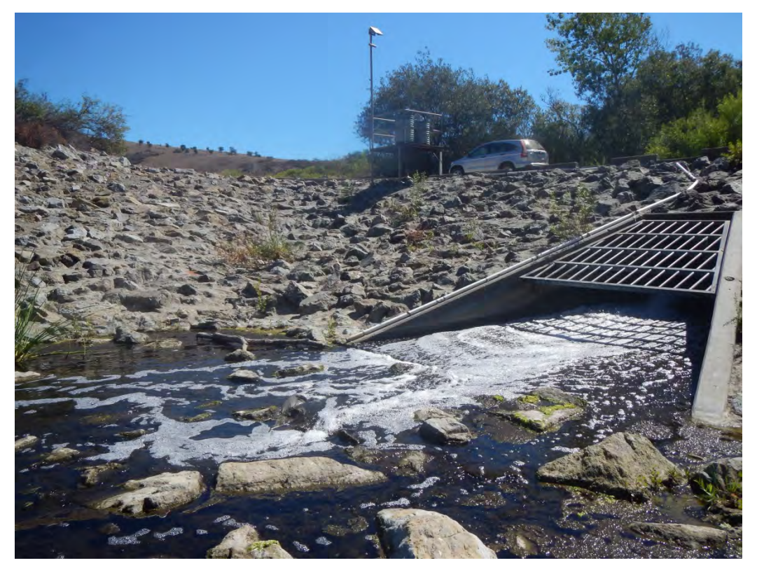
Photo 21 – Looking U/S at D/S End of Outlet Pipe through ACWHEP Structure