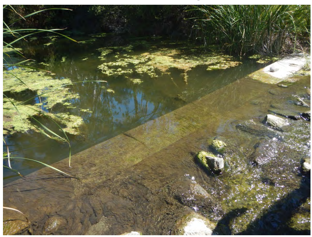
Photo 28 – U/S Limit of Grouted Riprap underneath SOCWA Coastal Treatment Plant Bridge