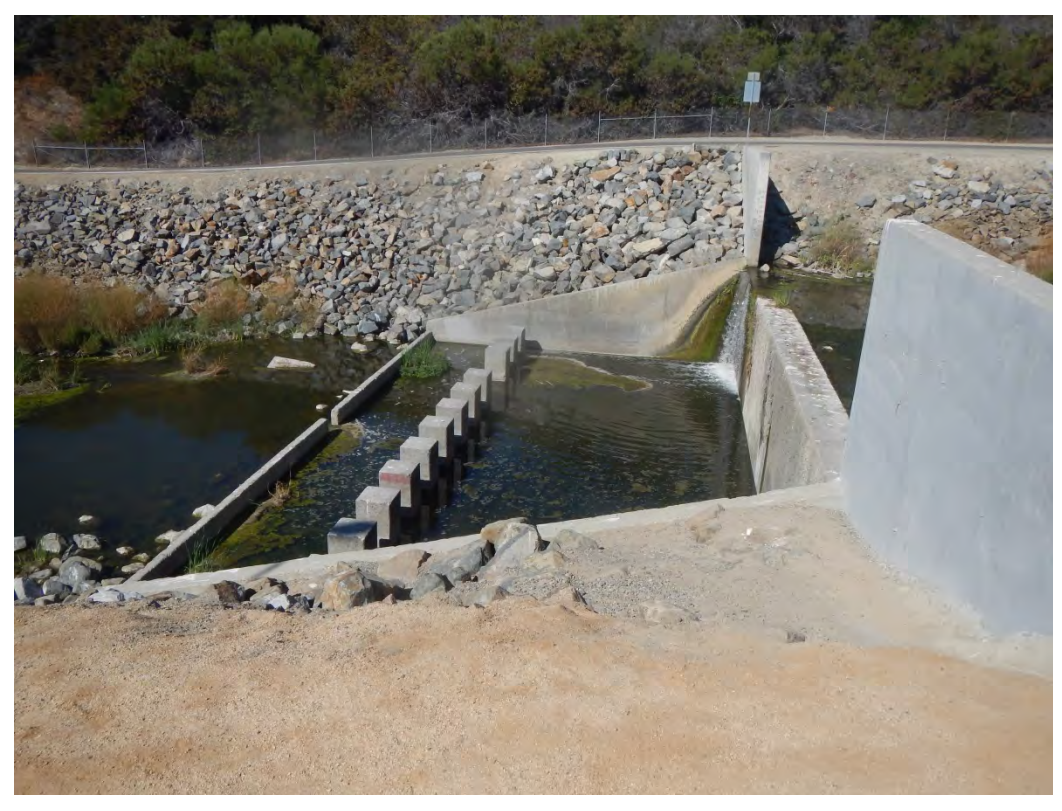
Photo 7 – Drop Structure to be Removed, Located U/S of Aliso Creek Road Bridge (Close-up)