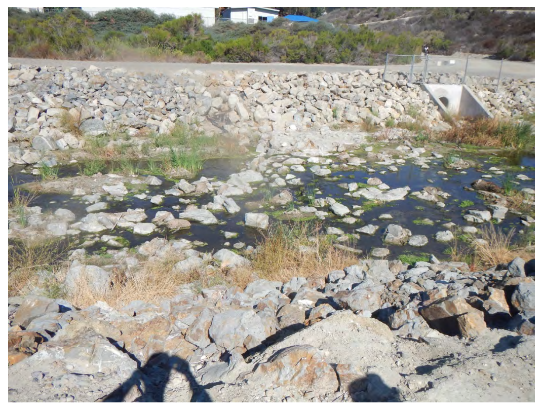
Photo 3 – Grouted Riprap across Streambed Possibly for Utility Crossing (approximately 180' D/S of Pacific Park Drive Culvert D/S Face)