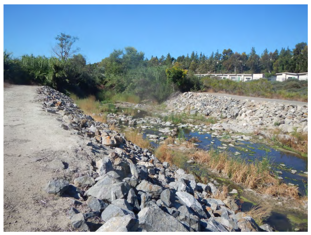
Photo 2 – Looking D/S along Aliso Creek from Pacific Park Drive Culvert