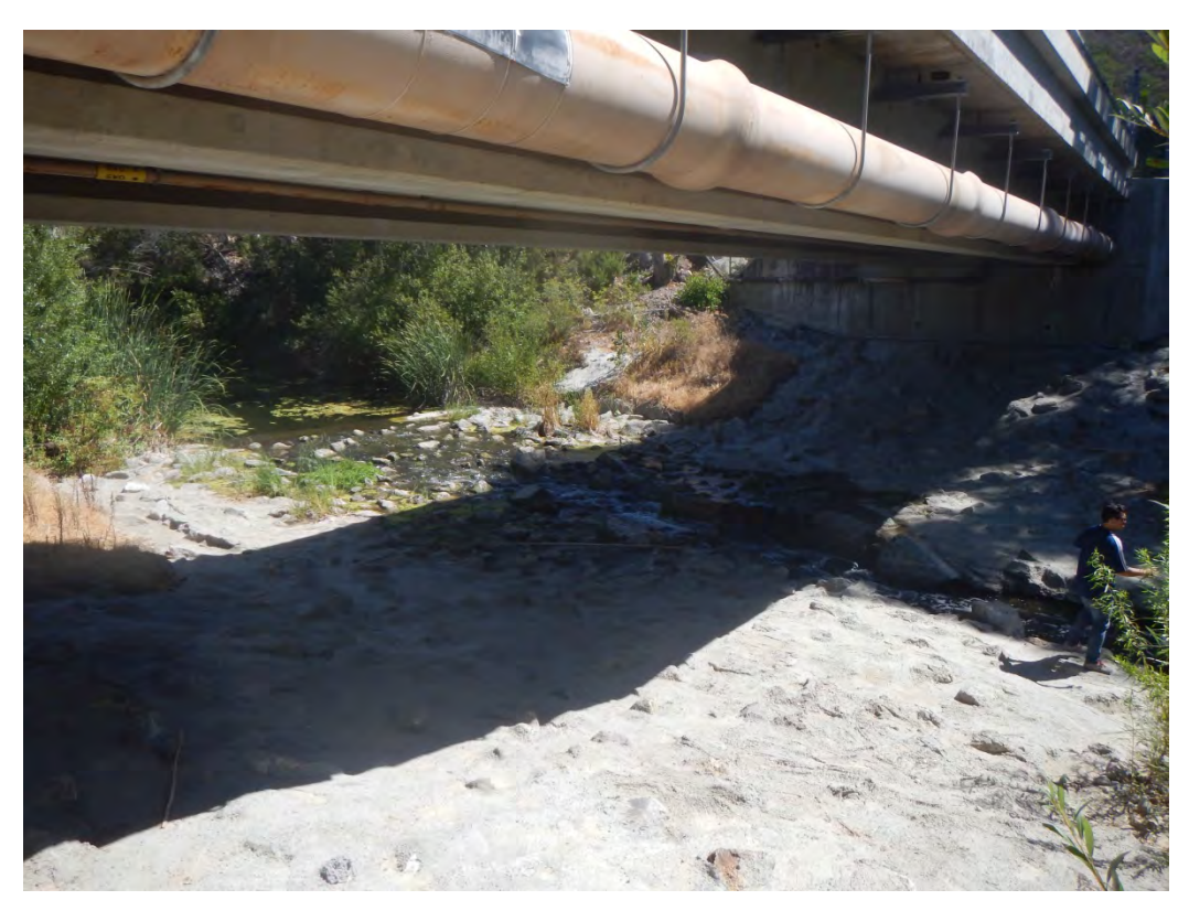
Photo 26 – Looking at D/S Face of SOCWA Coastal Treatment Plant Bridge

Photo 25 – Looking U/S along Aliso Creek from SOCWA Coastal Treatment Plant Bridge