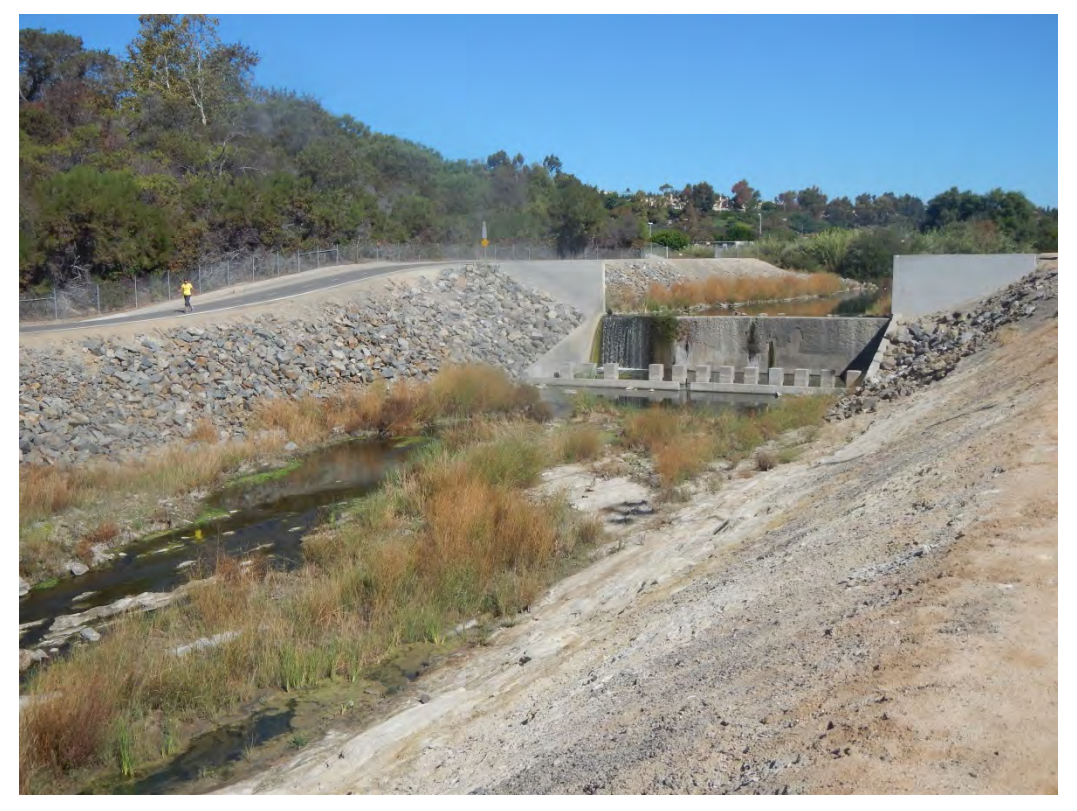
Photo 6 – Drop Structure to be Removed, Located U/S of Aliso Creek Road Bridge