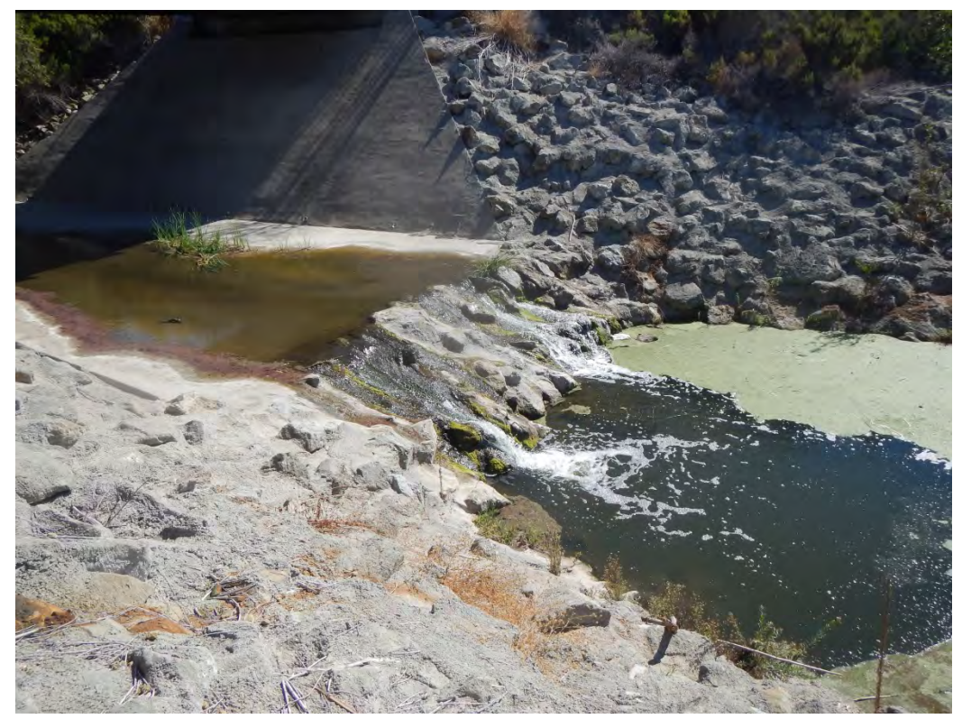
Photo 15 – Grouted Riprap Drop Structure Immediately D/S of AWMA Road Bridge