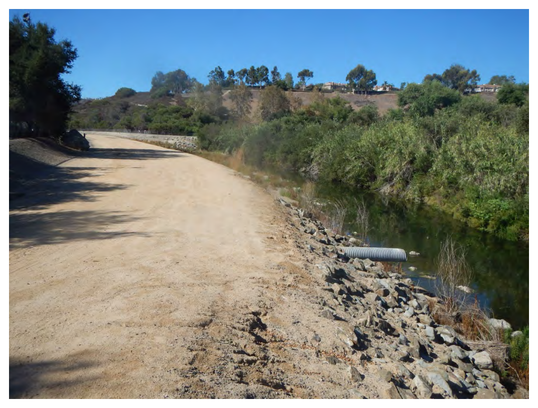
Photo 5 – Access Road along East Bank of Aliso Creek near Skate Park/Soccer Field