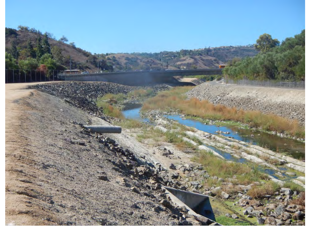
Photo 8 – Looking D/S along Aliso Creek at Aliso Creek Road Bridge from Drop Structure to be Removed