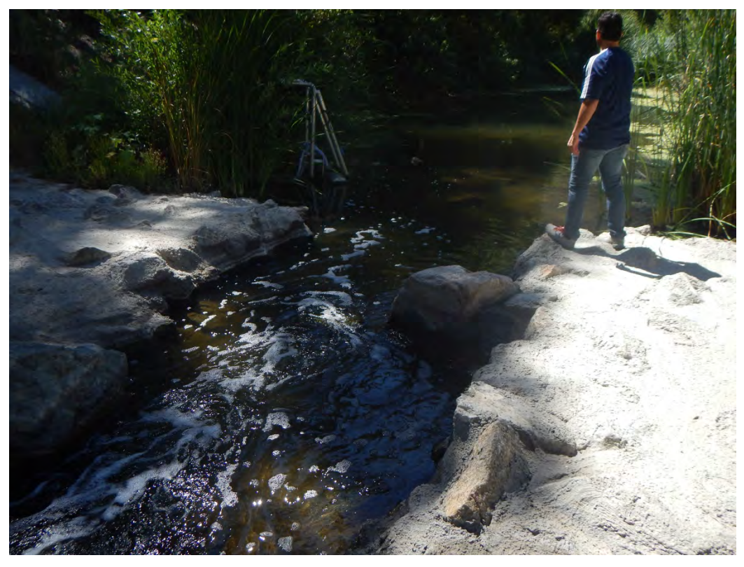
Photo 29 – D/S Limit of Grouted Riprap underneath SOCWA Coastal Treatment Plant Bridge