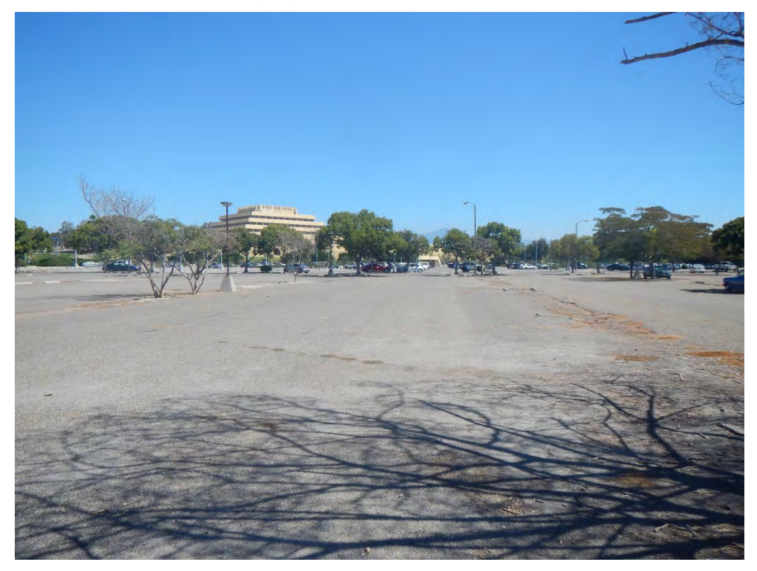
Photo 30 – Typical View of Un-used Parking Lot across Alicia Parkway for Skate Park/Soccer Field Relocation

Photo 29 – D/S Limit of Grouted Riprap underneath SOCWA Coastal Treatment Plant Bridge