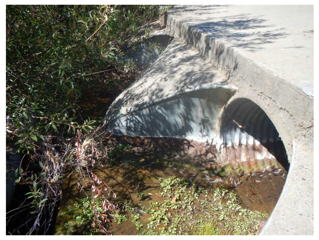
Photo 22 – D/S End of Wood Canyon Creek Culverts under Paved Trail at Aliso Creek Confluence ((3) 42"(W) x 30"(H) Elliptical CMPs)