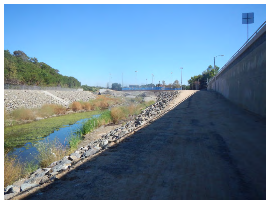
Photo 10 – Looking U/S along Aliso Creek from Aliso Creek Road Bridge