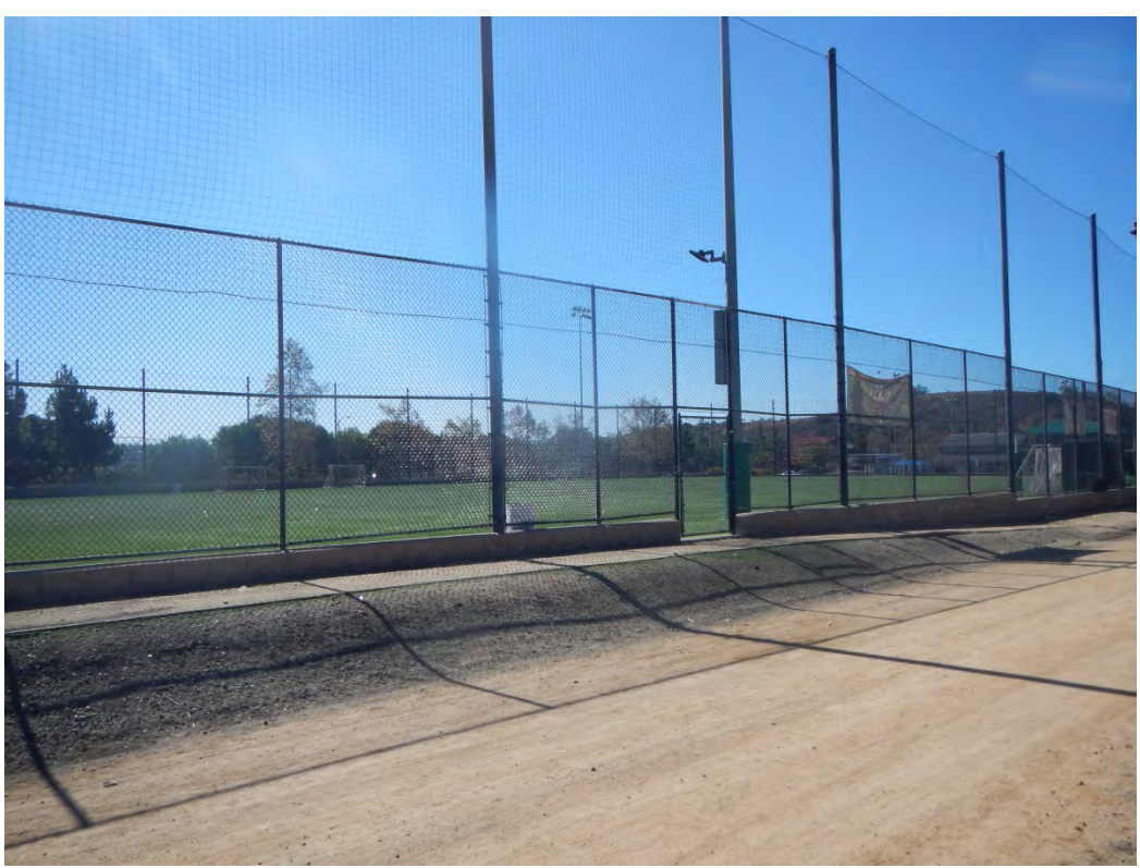
Photo 4 – Skate Park / Soccer Field to be Relocated (on East Bank)