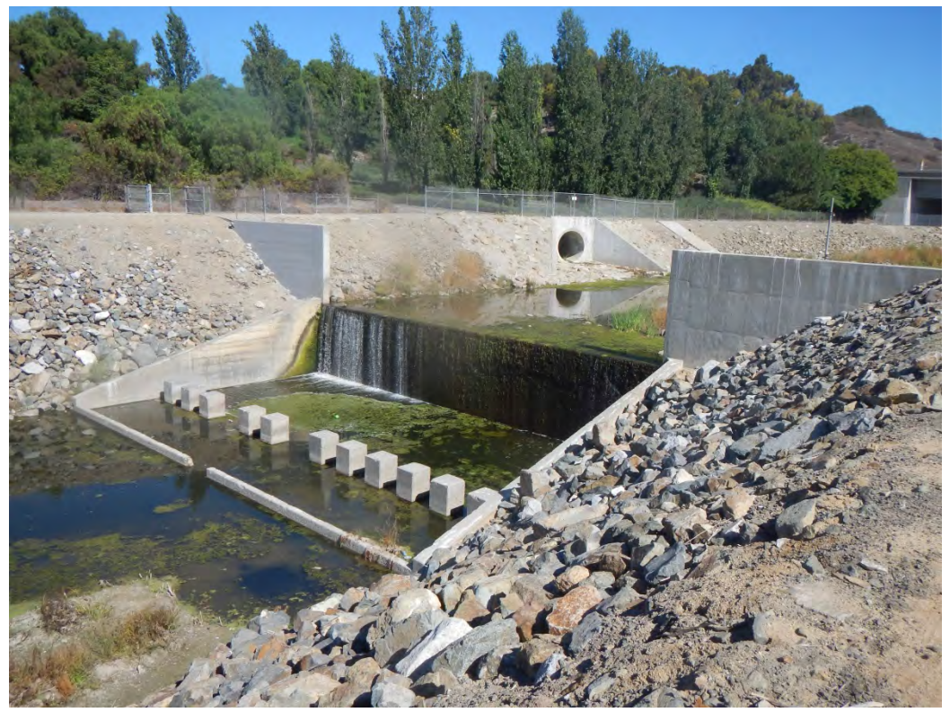
Photo 12 – Drop Structure to be Removed, Located D/S of Aliso Creek Road Bridge

Photo 11 – Looking U/S at SD outlet on West Bank (Aliso Creek Road Bridge to the Right of Photo)