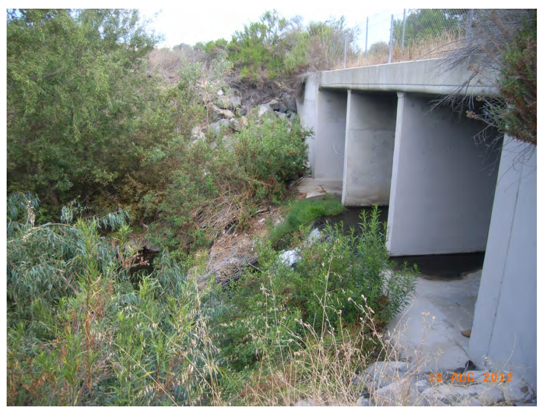
Photo 17 – Existing RCB Culvert along Sulphur Creek underneath Alicia Parkway