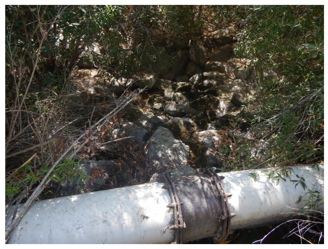
Photo 23 – Looking D/S at Aliso Creek Confluence from Wood Canyon Creek Culverts