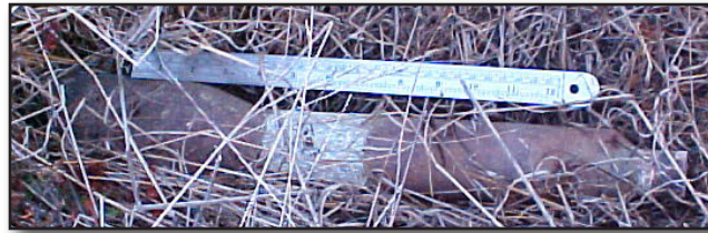
Inert 3.5-inch rocket at UCSD (Camp Matthews) FUDS

The U.S. Army Corps of Engineers is planning a Remedial Investigation and Feasibility Study within portions of Range Complex No. 1. The purpose is to identify the nature and extent of munitions that may remain on the property and to evaluate remedial alternatives.