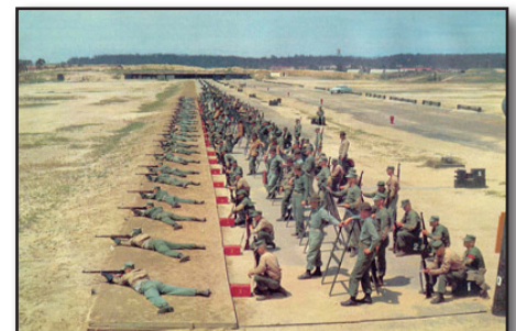
Marine rifle range at Camp Matthews

Numerous munitions items have been found at the former Camp Matthews since its closure. Based on these findings and the site history, the U.S. Army Corps of Engineers is investigating UCSD (Camp Matthews) for munitions hazards through the Formerly Used Defense Sites Program.