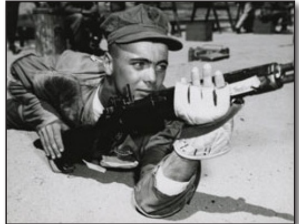
Rifleman at former Camp Matthews

In 1962, Congress passed legislation directing the Navy to transfer the Camp Matthews property to UCSD. The last shots were fired at Camp Matthews in 1964. Since the transfer, munitions debris and munitions and explosives of concern have been identified on portions of the former camp.