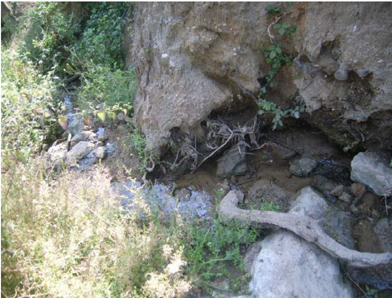
Photo 4: Surface water presence, eroded soils, and sediment deposition upstream of the project area