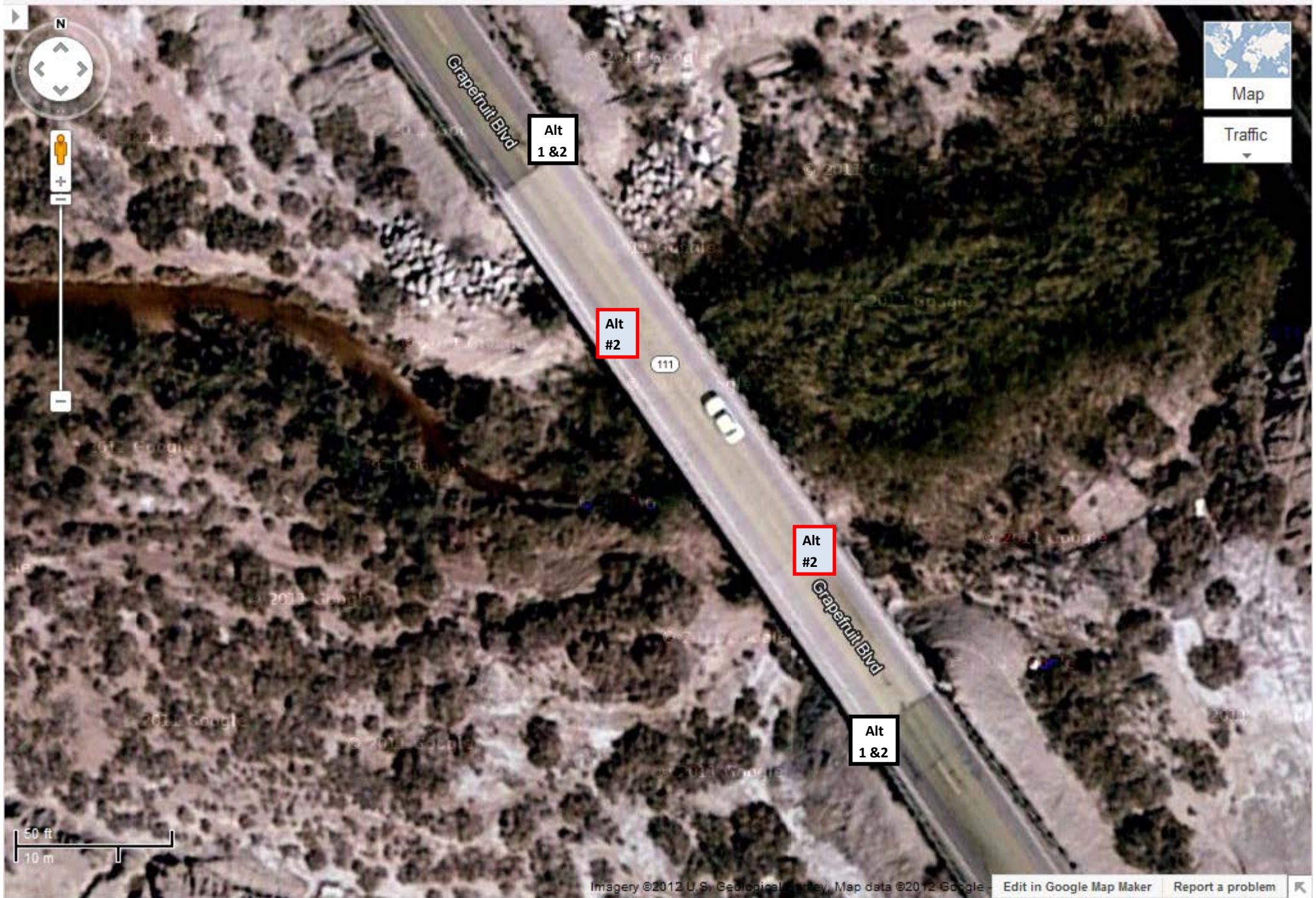
Alternative 1 (2 span) requires 3 and Alternative 2 (3 span) requires 4 borings, as shown.