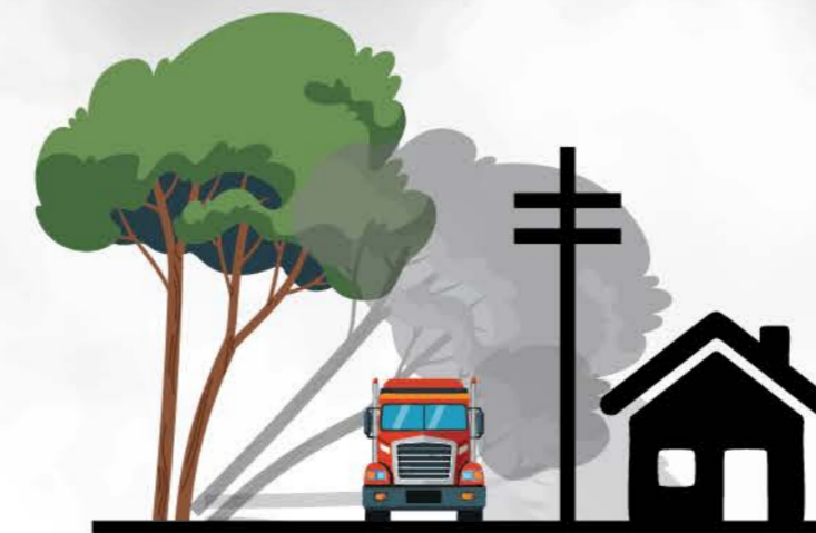
Potential to fall