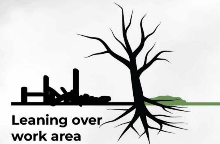
Leaning over work area