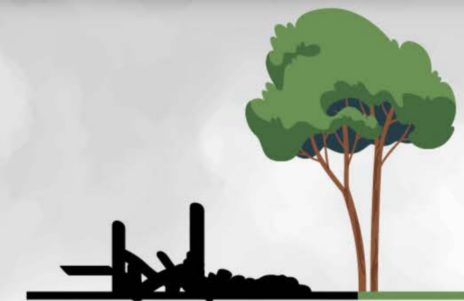
Too close to the slab and/or ash footprint