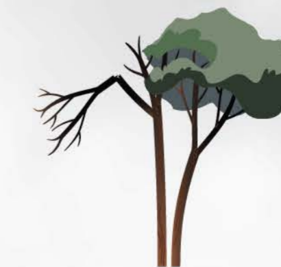
Likely to die within five years