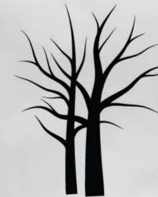
Dead or dying tree