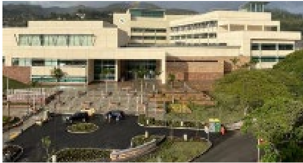
Fort Irwin Simulations Center

The United States Army Corps of Engineers (USACE), through its Military program, provides planning, engineering design and construction management, environmental services, and technical assistance related to water, natural resources, buildings and infrastructure. Assistance can vary from providing highly specific technical advice to complete program management services.