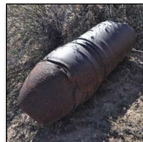
Example of a 100-lb. practice bomb remnant.