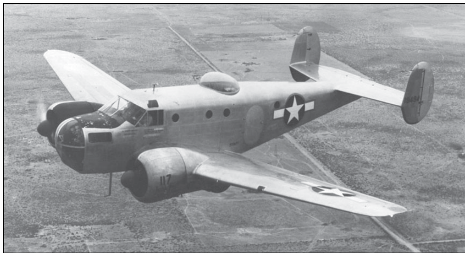
A Beechcraft AT-11 bombing training plane similar to the aircraft used at the Deming Army Air Field.

In 1942, the War Department officially acquired 960 acres from the public domain for Deming PBR No. 24. The site was used until 1944 as a daytime precision bombing target by pilots and bombardiers stationed at Deming Army Air Field.