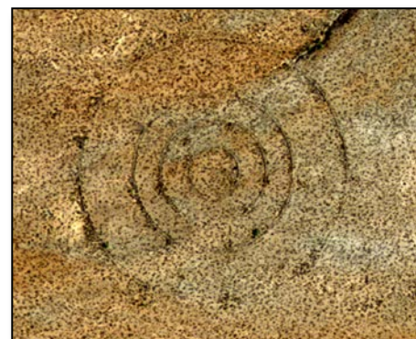
Aerial photo of the concentric circles of the daytime bomb target.

The site was declared surplus in October 1945 and transferred to the Department of the Interior in 1946.