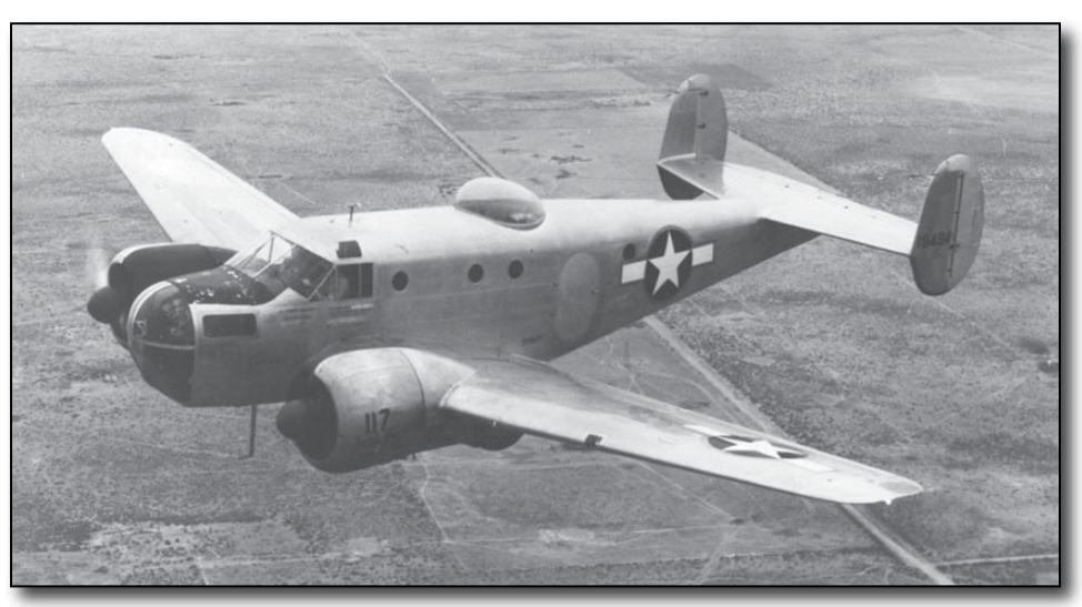
A Beechcraft AT-11 bombing training plane similar to the aircraft used at the Deming Army Air Field.

In 1942, the War Department officially acquired 960 acres from the public domain for Deming PBR No. 24. The site was used until 1944 as a daytime precision bombing target by pilots and bombardiers stationed at Deming Army Air Field.