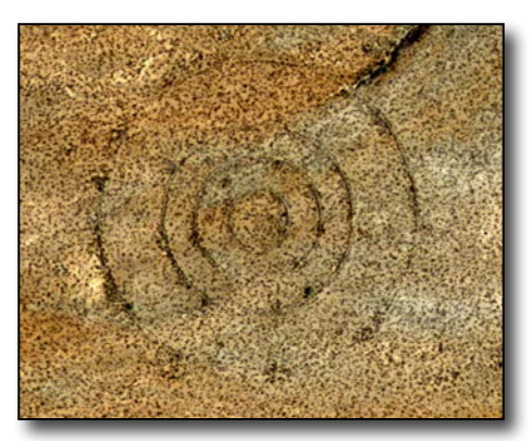
Aerial photo of the concentric circles of the daytime bomb target.

The site was declared surplus in October 1945 and transferred to the Department of the Interior in 1946.