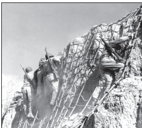
Soldiers from Fort Huachuca assault the ghost town of Charleston, Ariz. by scaling cargo nets. Date unknown.

The U.S. Army Corps of Engineers is the organization responsible for environmental remediation of properties that were formerly owned by, leased to or otherwise possessed by the Department of Defense and transferred from DOD control prior to 17 October 1986. These properties are known as Formerly Used Defense Sites.