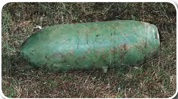
Example of a general purpose bomb