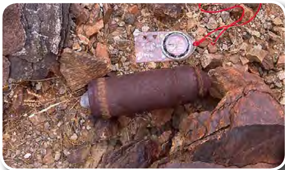
Example of a medium caliber munition