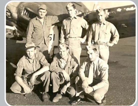
U.S. Marine Corps flight and ground crew in front of an F4U Corsair airplane in 1943