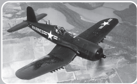
F4U Corsair airplane in flight from Marine Corps Air Station Mojave