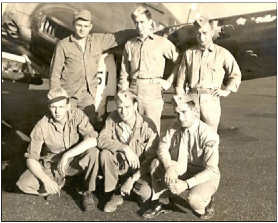
U.S. Marine Corps flight and ground crew in front of an F4U Corsair airplane. c. 1943.

Historical records indicate that MRS 04 was used for rocket firing and other air-to-ground training, such as aerial bombing. MRS 06 contains two targets that were used for bombing, rocket and other air-to-ground training. MRS 07 was a bombing target used for bombing and other air-toground training.