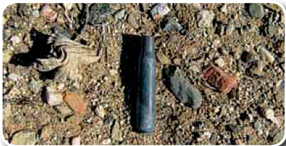
Small arms ammunition at the former Mohave Maneuver Area C