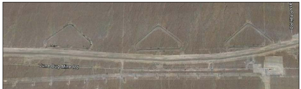
Aerial view of the former target ranges at the Nellis Small Arms Range

Additional range clearances were conducted in 1972, 1977, 1978 and 1995. Throughout this period, munitions items continued to be found, indicating that munitions and explosives of concern may still remain on the Nellis Small Arms Range.