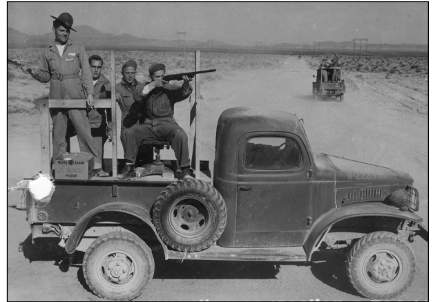
An improvised moving skeet-shooting trainer used in early 1942

In 1953, a range clearance was performed on 26,000 acres. In August 1954, approximately 25,620 acres were relinquished to BLM, and in July 1961 an