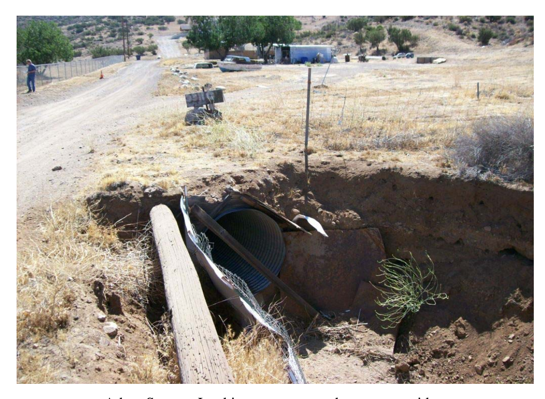
• Adam Street – Looking upstream at downstream side