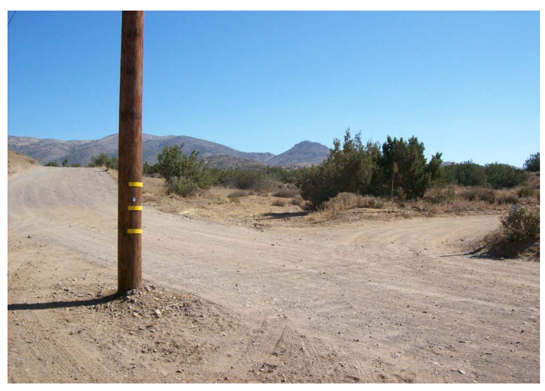
• Acton Canyon Road – Looking upstream