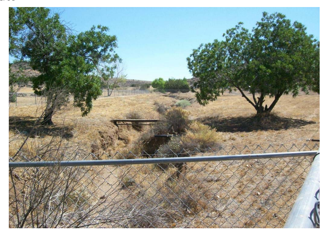
• Adam Street – Looking upstream