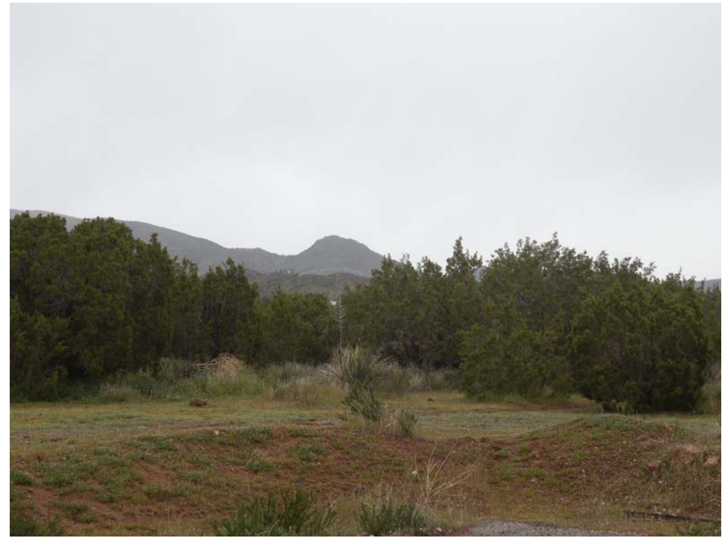
NE of Confluence between Acton 1 and Action 2 Canyon