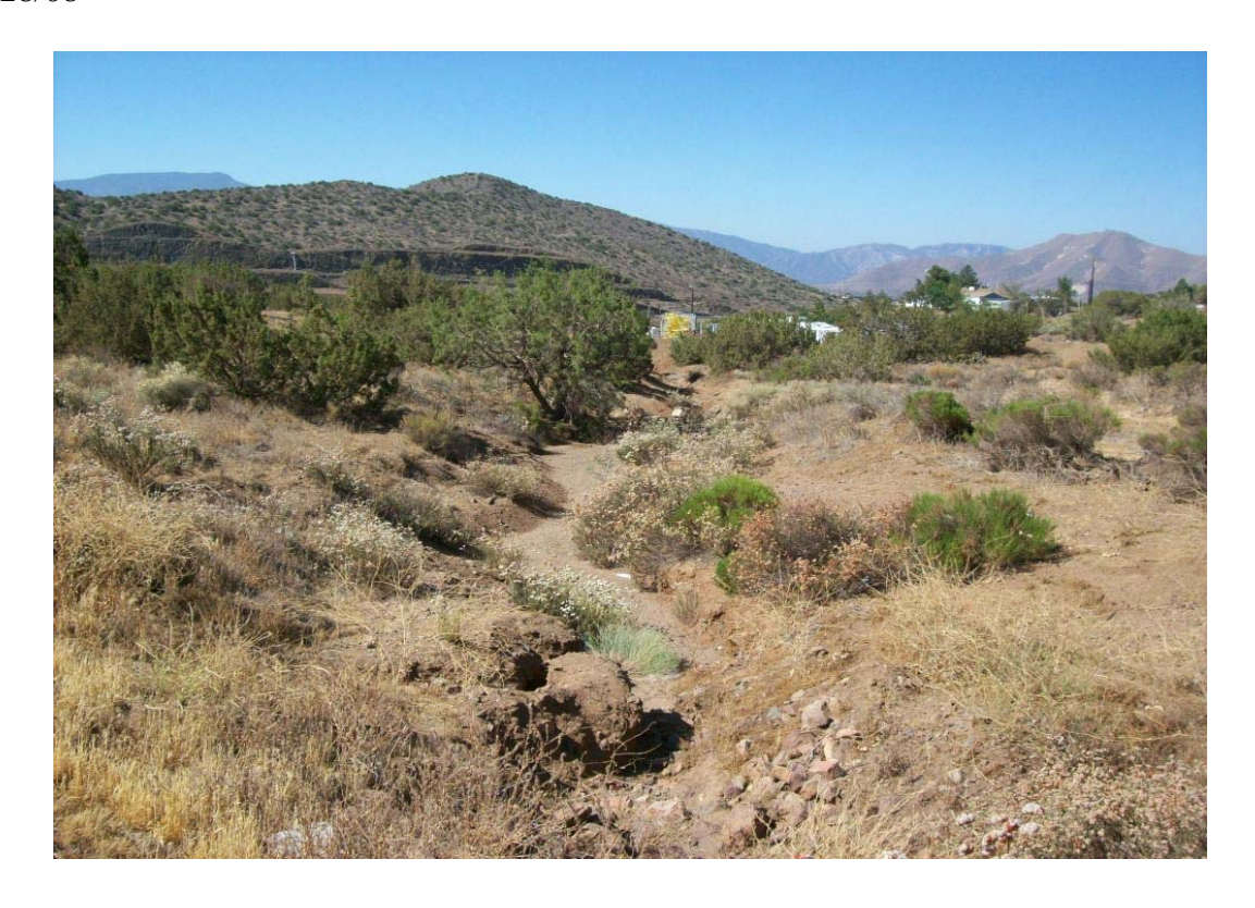
• Acton Canyon Road – Looking downstream