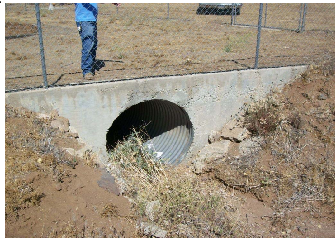
• Private Road – Upstream side of culvert