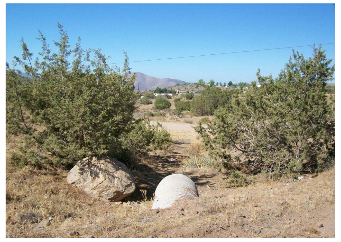
• Overflow Channel along Acton Cyn Rd – Looking downstream