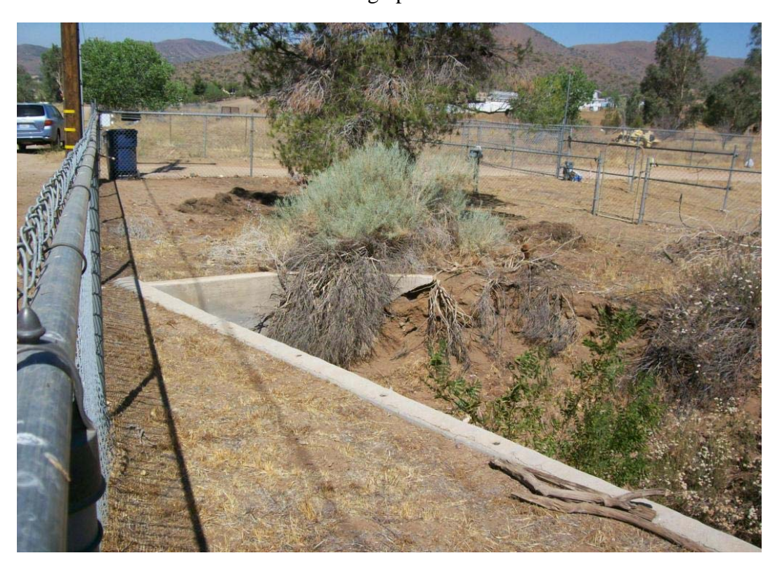
• Adam Street – Upstream side of culvert