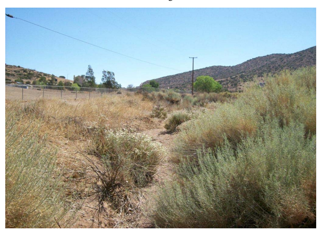
• Wisconsin Street – Looking upstream