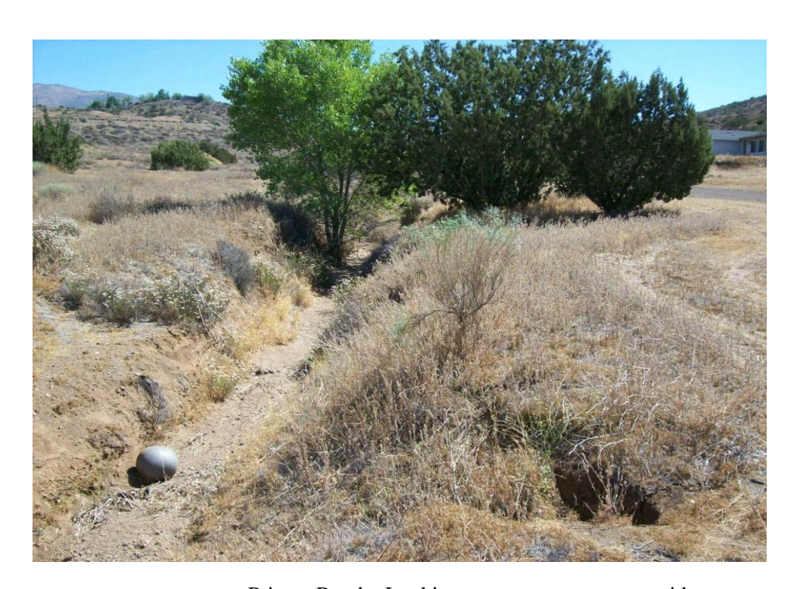
• Private Road – Looking upstream at upstream side