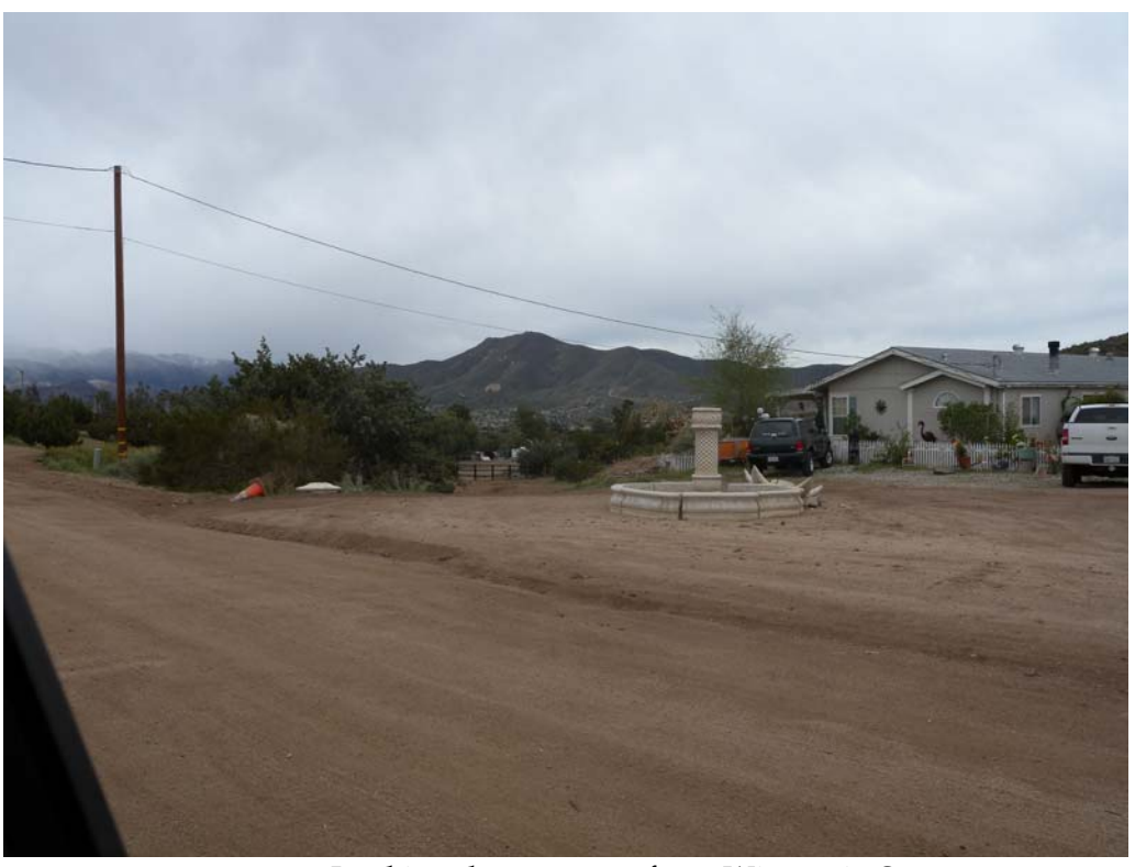
• Looking downstream from Wisconsin St