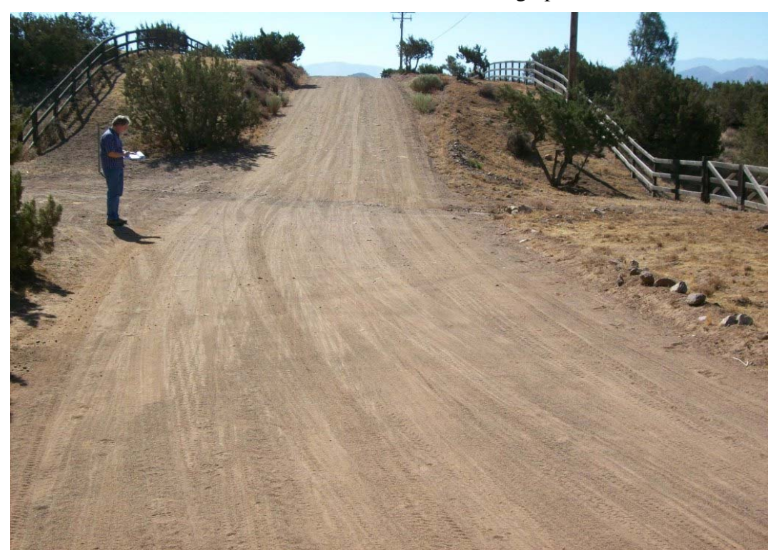
• Sache Street – Looking at dip crossing