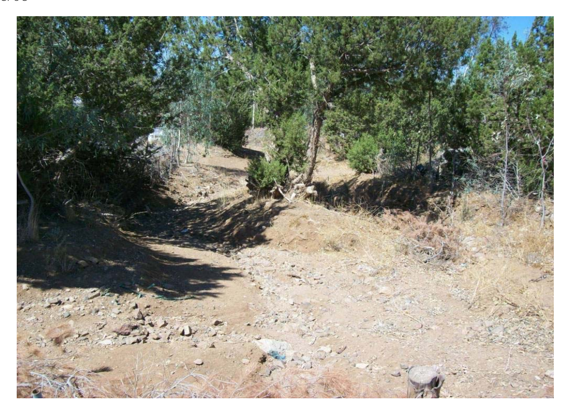
• Wisconsin Street – Looking downstream