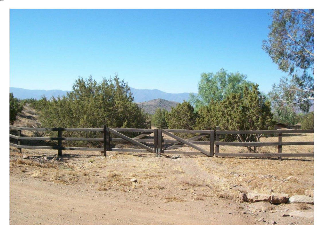
• Sache Street – Looking downstream