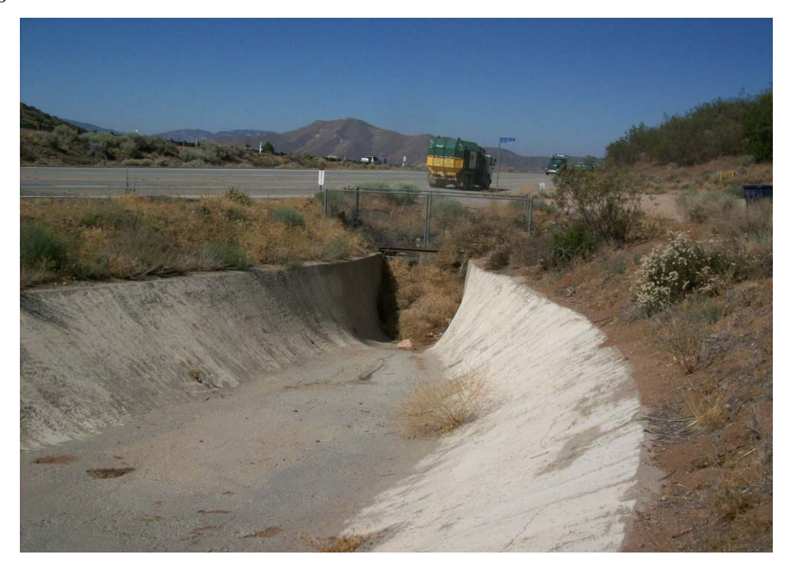
• Sierra HWY – Upstream side of the crossing culvert