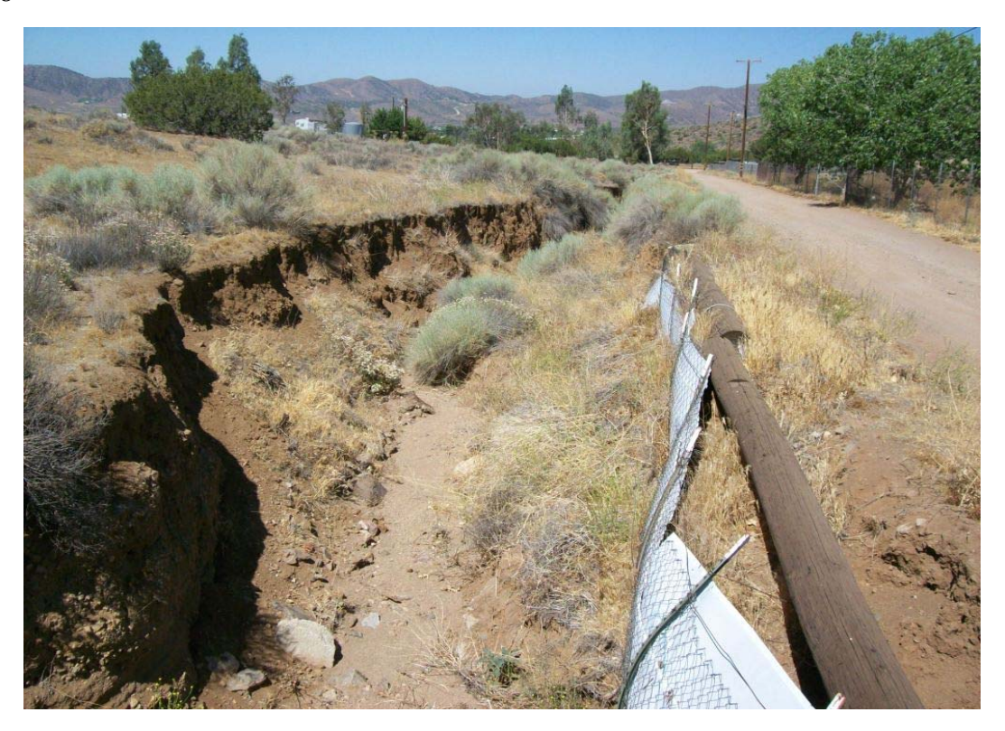
• Adam Street – Looking downstream