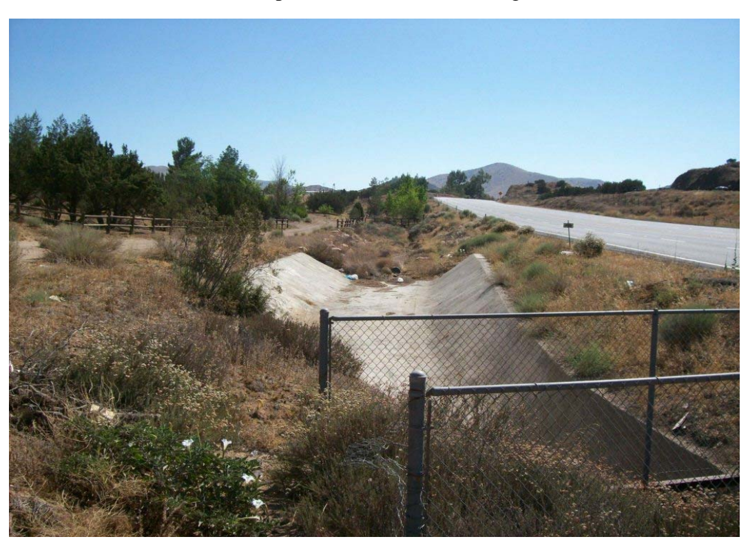
• Sierra HWY – Looking upstream at the upstream side of culvert