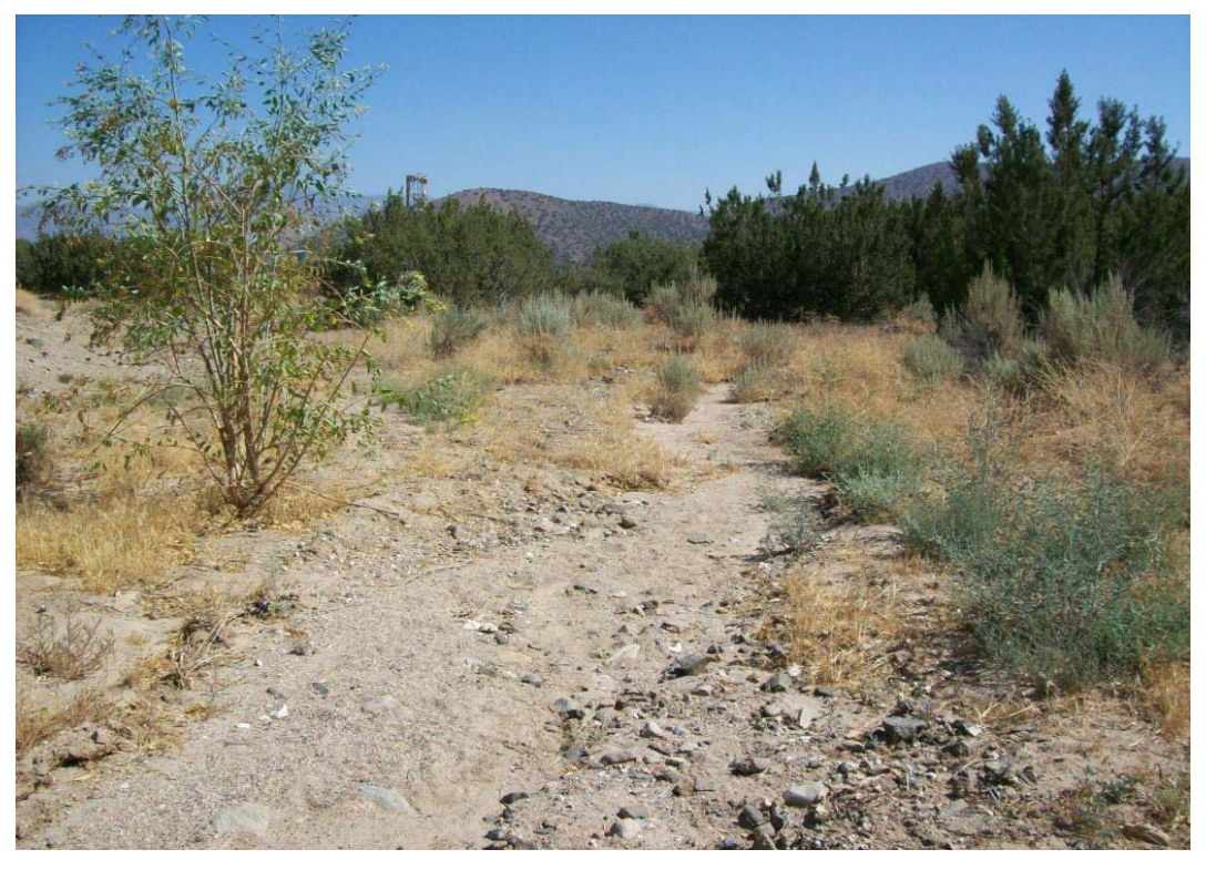
• Sierra HWY – Looking downstream at downstream side