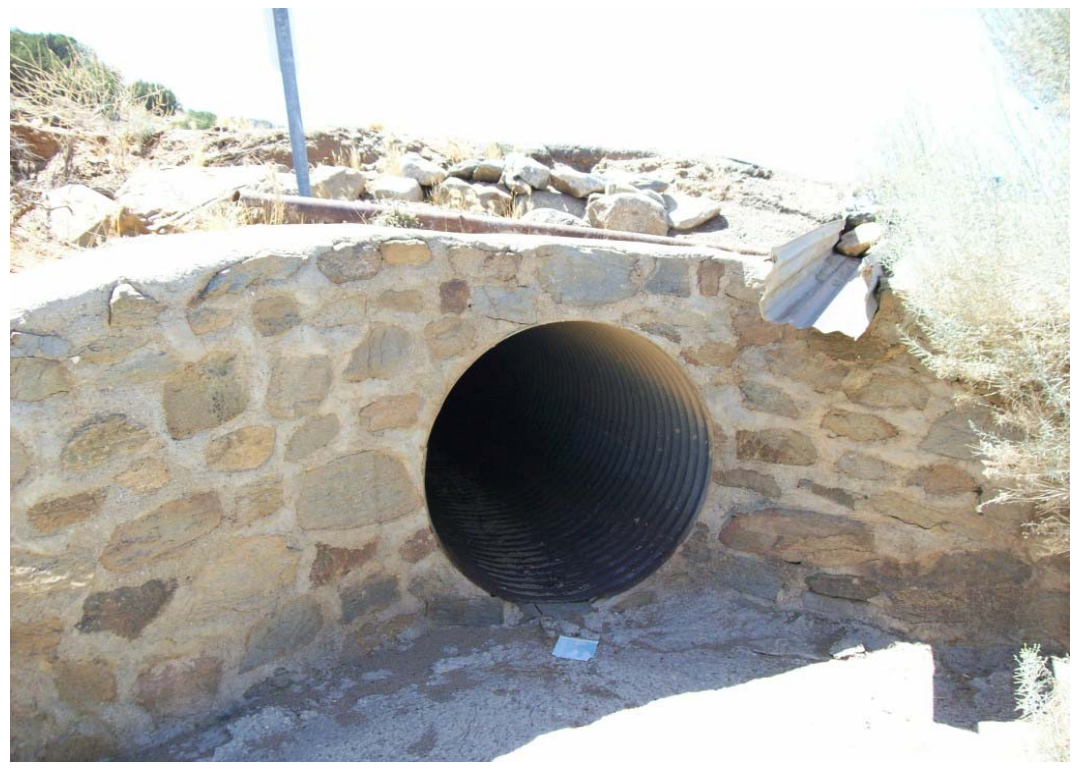
• Ward Road – Looking upstream at downstream side