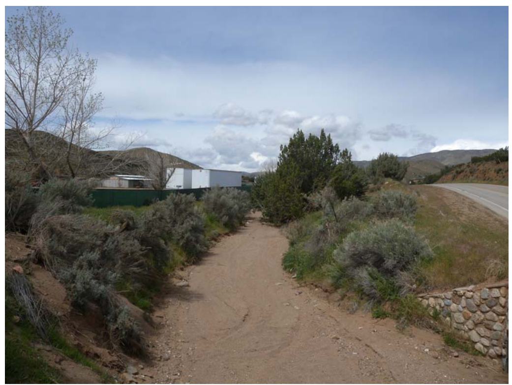
• Escondido Canyon Channel – Looking upstream

• Escondido Canyon Rd 1 – Looking upstream from downstream side