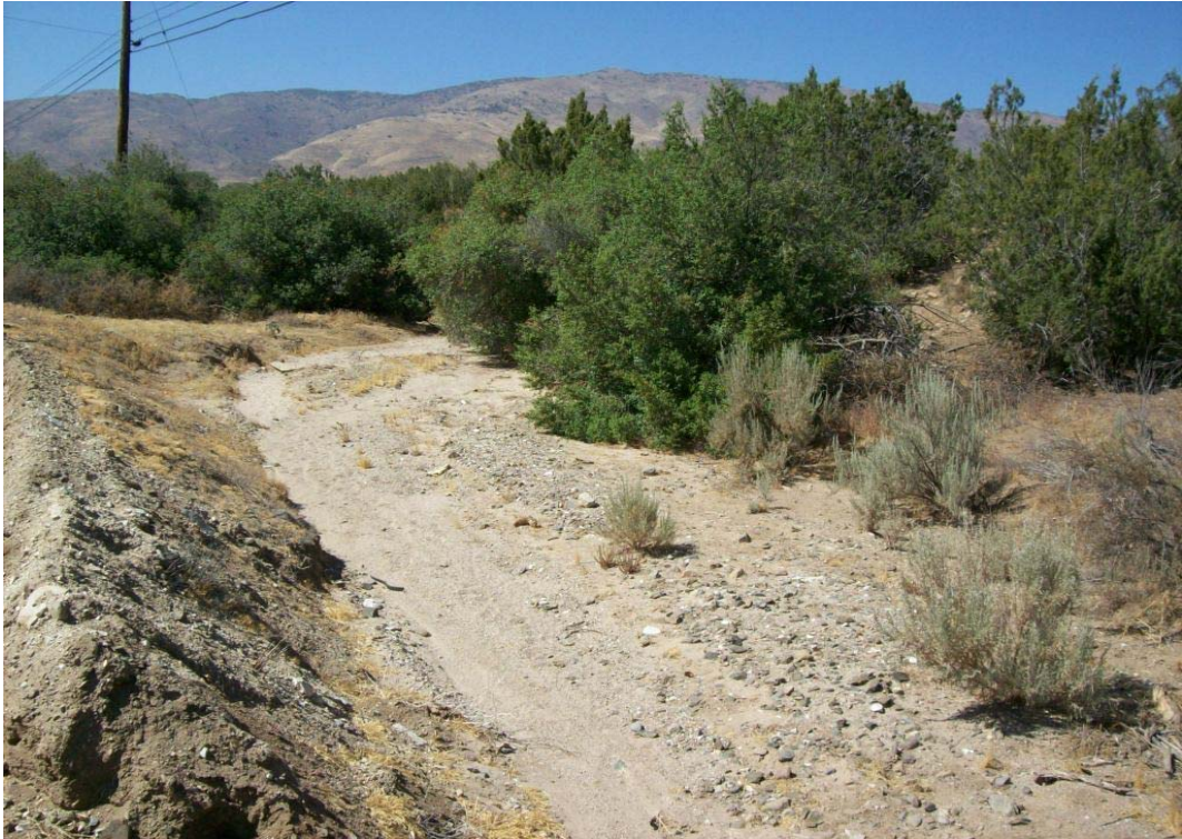
• Sierra HWY – Looking upstream at upstream side

Santa Clara River Watershed Feasibility Study Escondido Creek 7/28/08