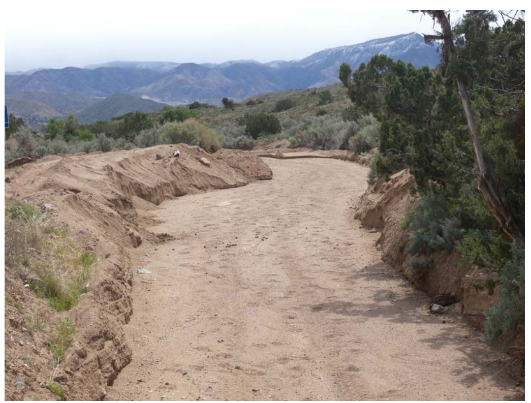
• Escondido Canyon Rd 1 – Looking upstream

• Escondido Canyon Rd 1 – Looking downstream from upstream side