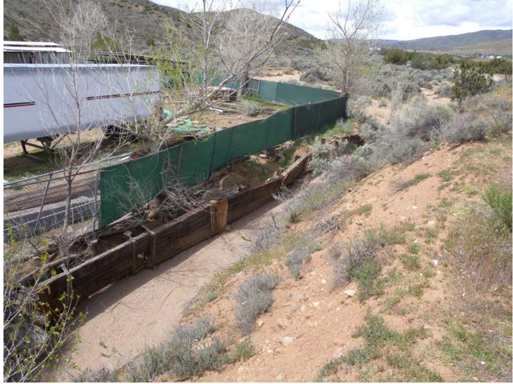
• Escondido Canyon Channel – Looking upstream

Santa Clara River Watershed Feasibility Study Escondido Canyon 03/31/10