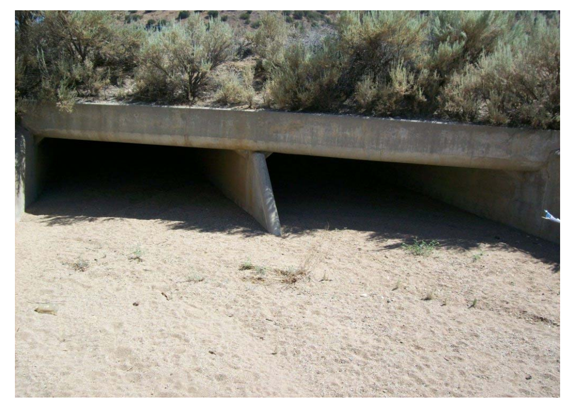
• HWY 14 - Looking downstream at upstream side