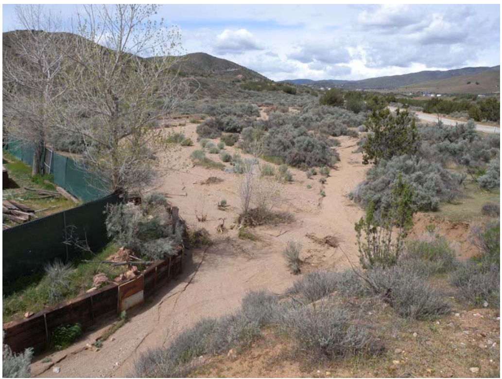
• Escondido Canyon Channel – Looking downstream