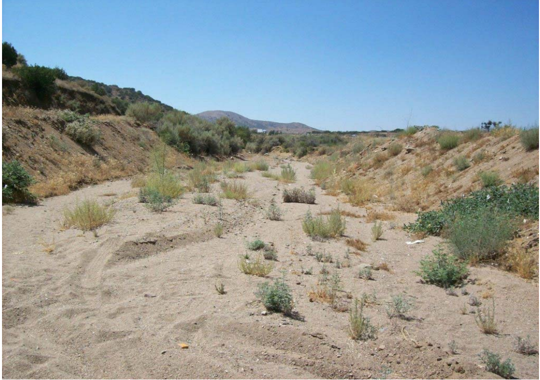
• Ward Road – Looking upstream at upstream side