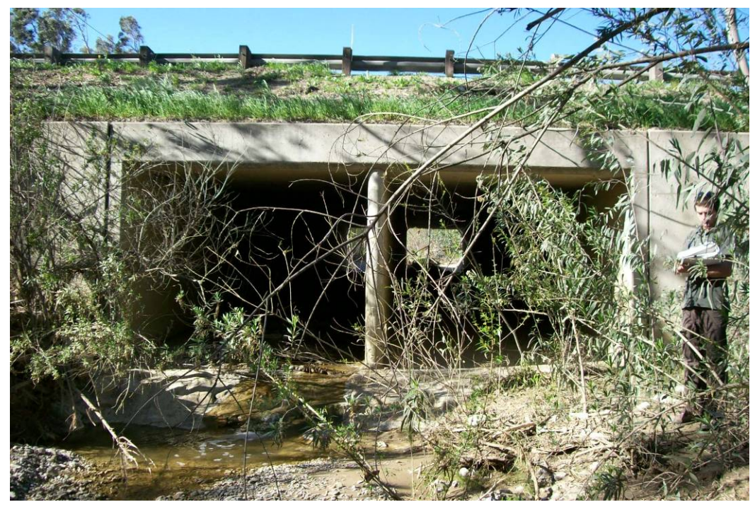
Highway 126 – Downstream of culvert looking upstream