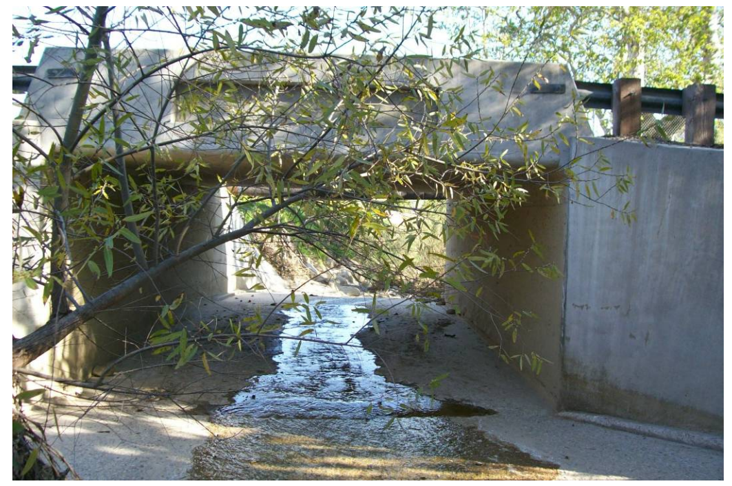
• Sycamore Road – Upstream side of culvert looking downstream