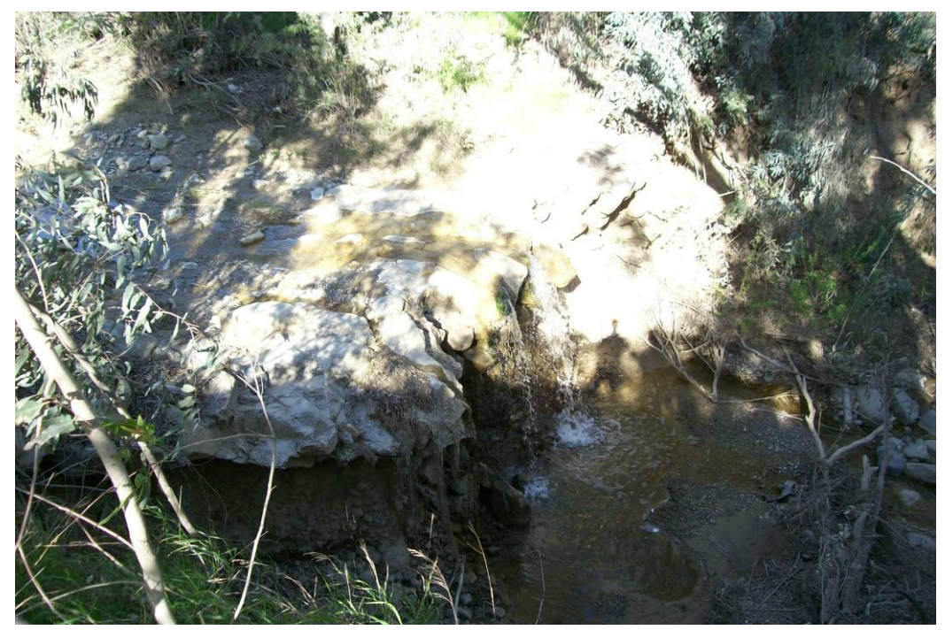
• Highway 126 – Drop (scour hole) downstream of bridge