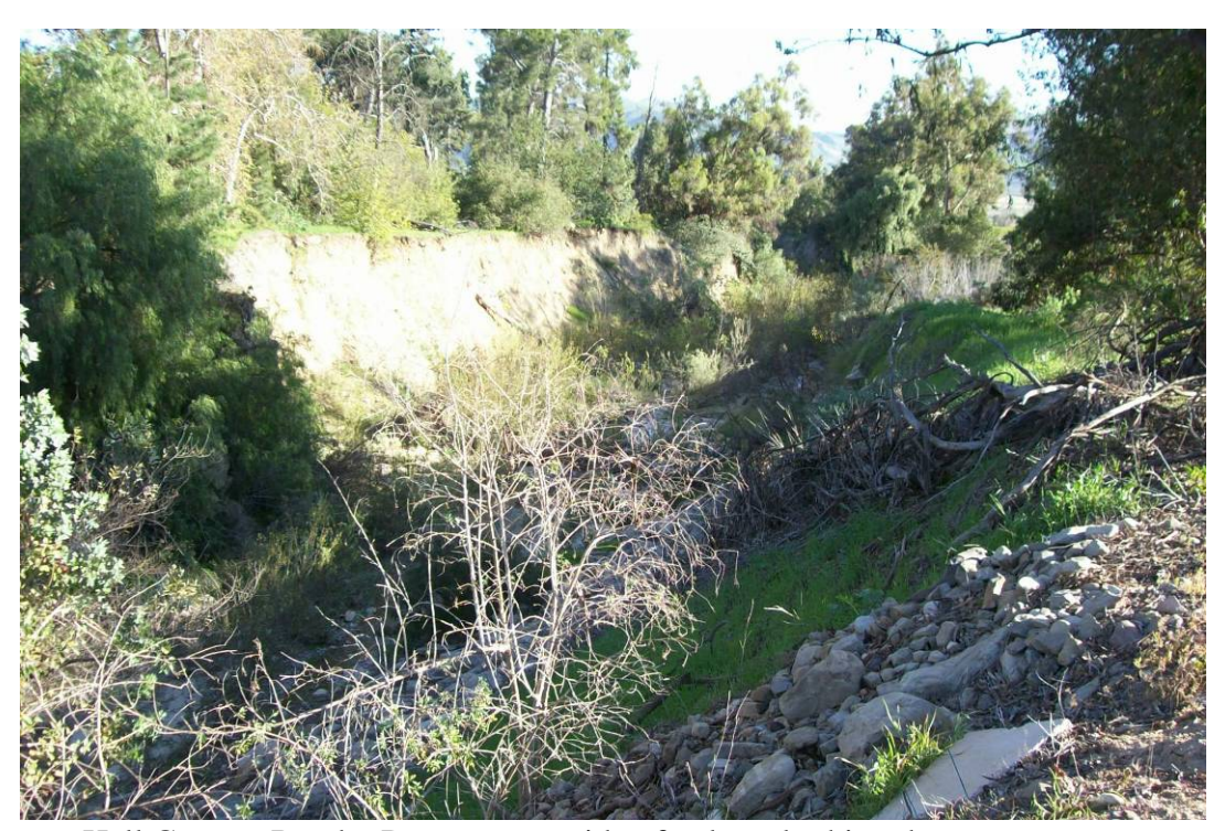
Hall Canyon Road – Downstream side of culvert looking downstream