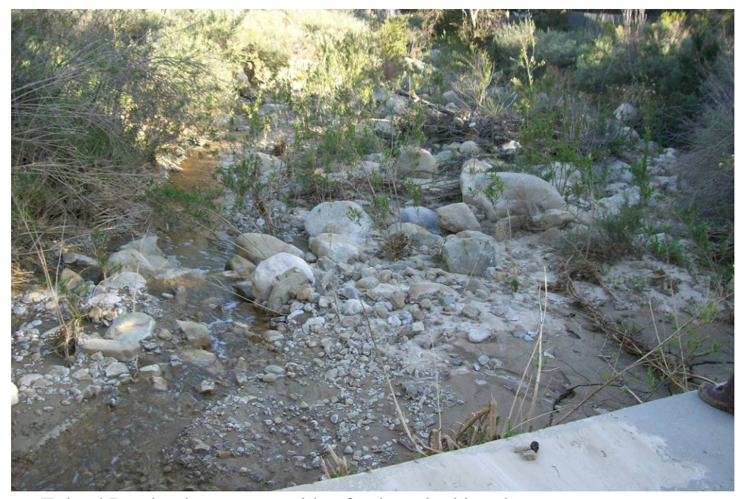
• Toland Road – downstream side of culvert looking downstream