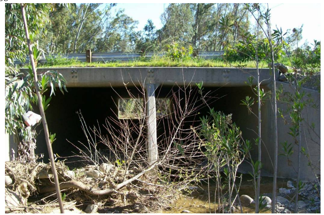
• Highway 126 – Upstream of culvert looking downstream