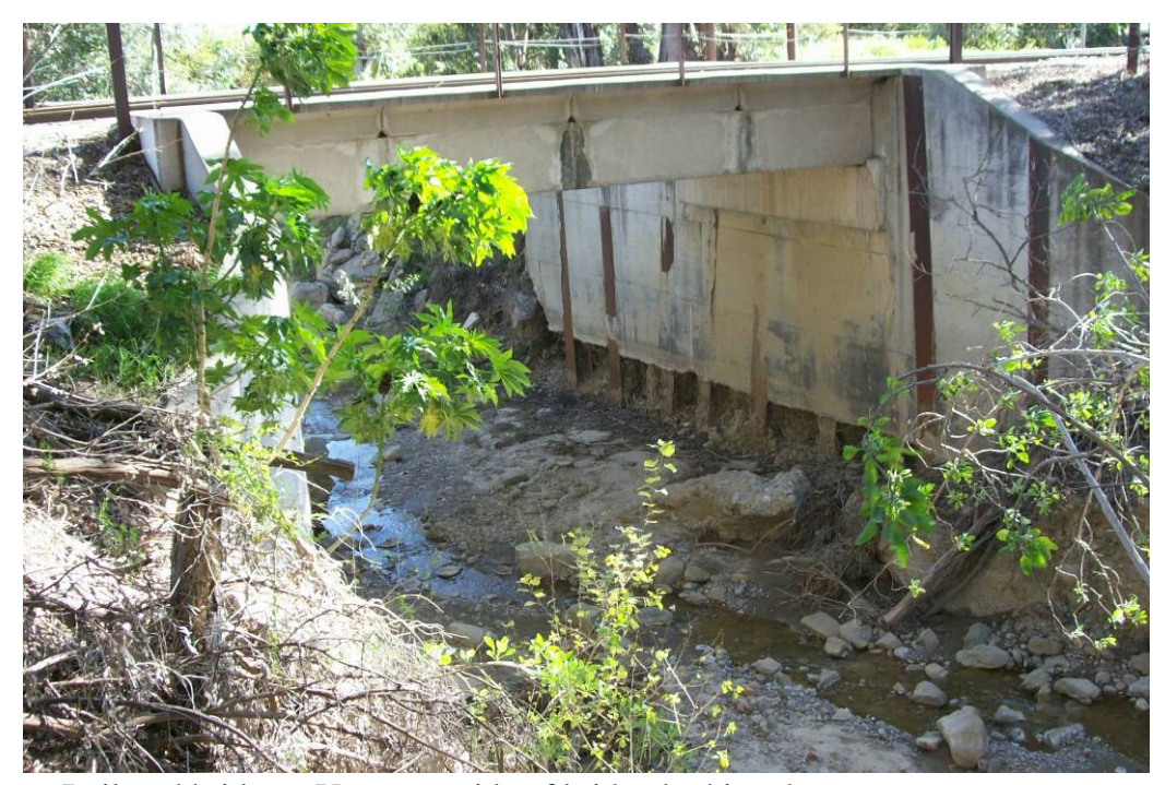
• Railroad bridge – Upstream side of bridge looking downstream

• Railroad bridge – Downstream side of RR bridge looking upstream