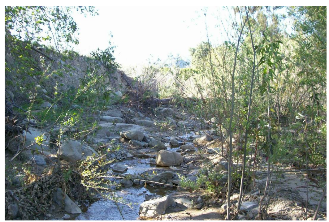
• Sycamore Road – Upstream side of culvert looking upstream