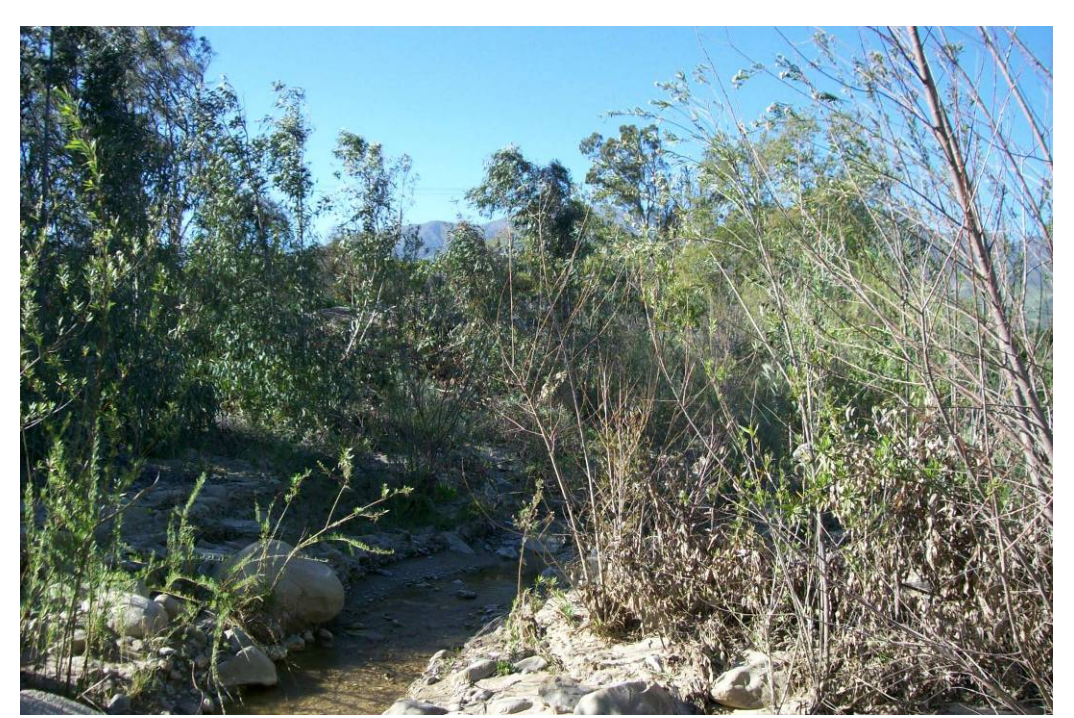
Highway 126 – Upstream of culvert looking upstream