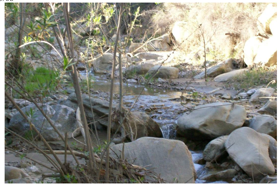
Hall Canyon Road – Upstream side of culvert looking upstream