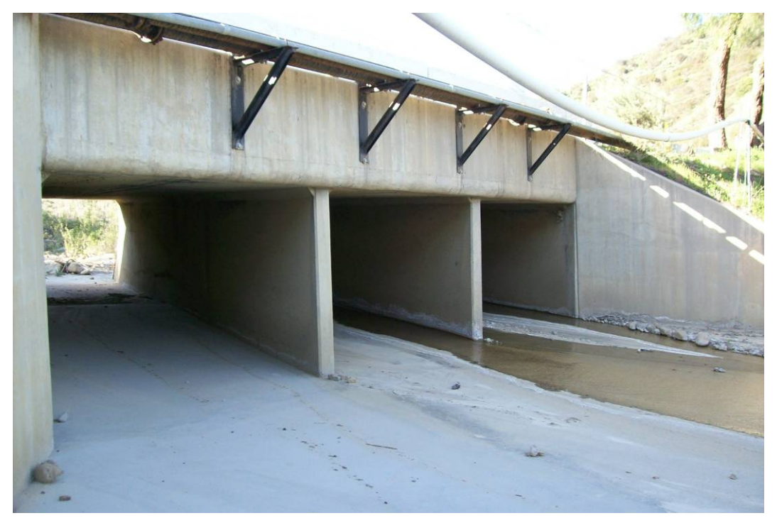
• Toland Road – Downstream side of culvert looking upstream