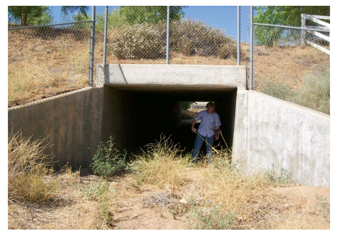
• Cattle Creek Road - Looking upstream at downstream side