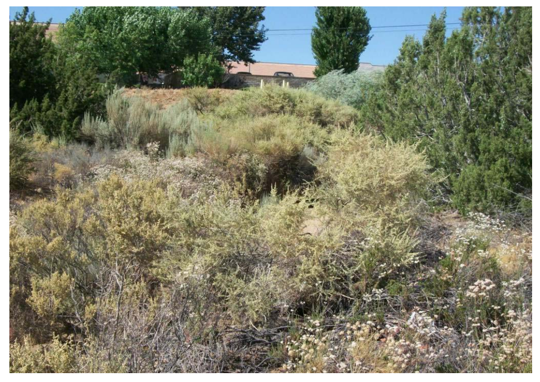
• HWY 14 - Looking downstream at upstream side

Santa Clara River Watershed Feasibility Study Trade Post Canyon 7/28/08