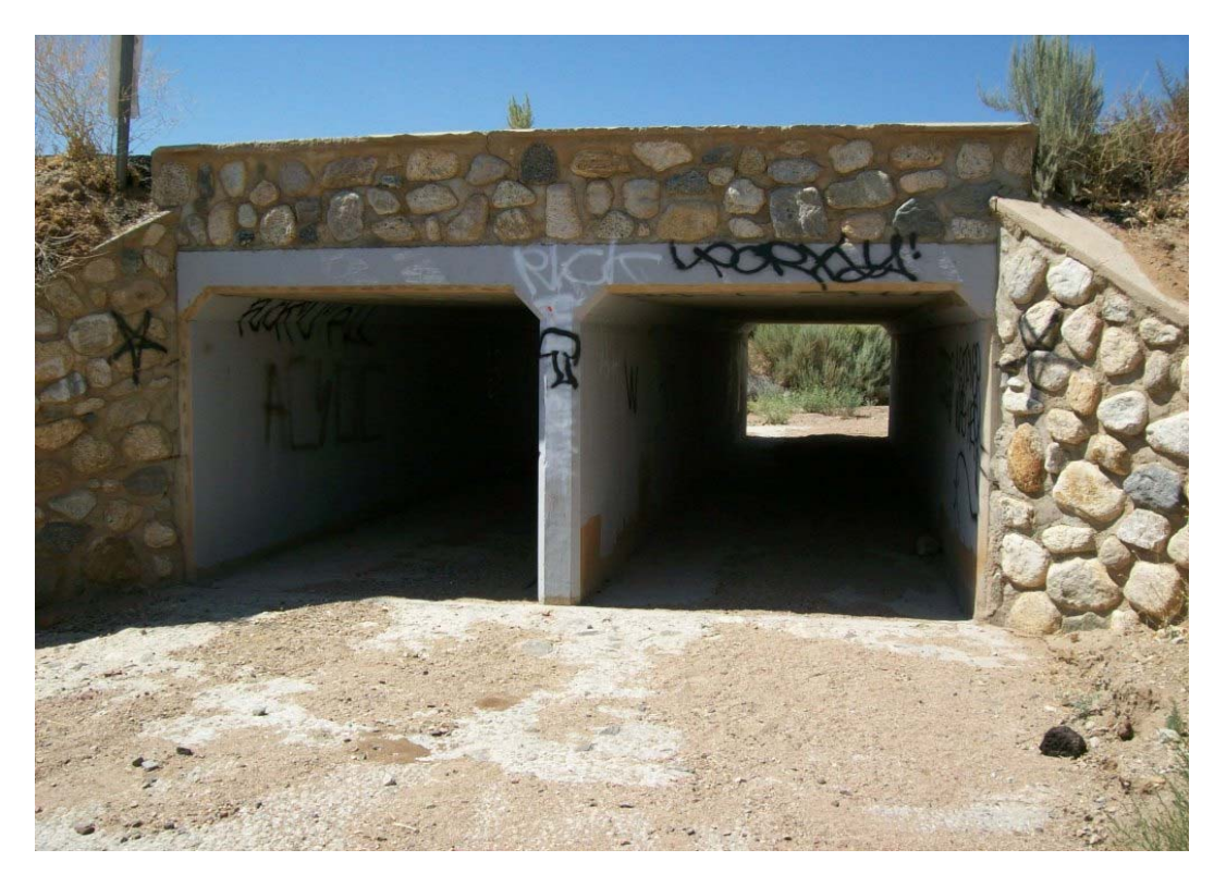
• Soledad Canyon Road – Looking upstream at downstream side