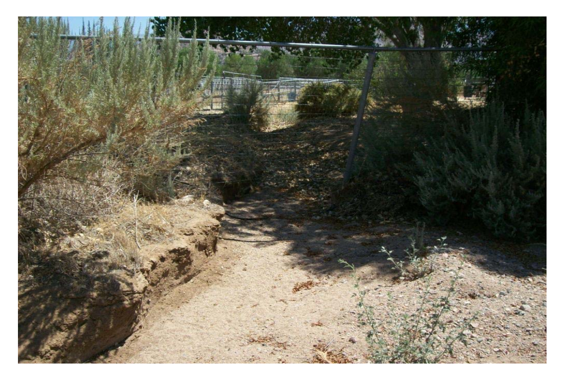
• Railroad crossing – Looking downstream at downstream side