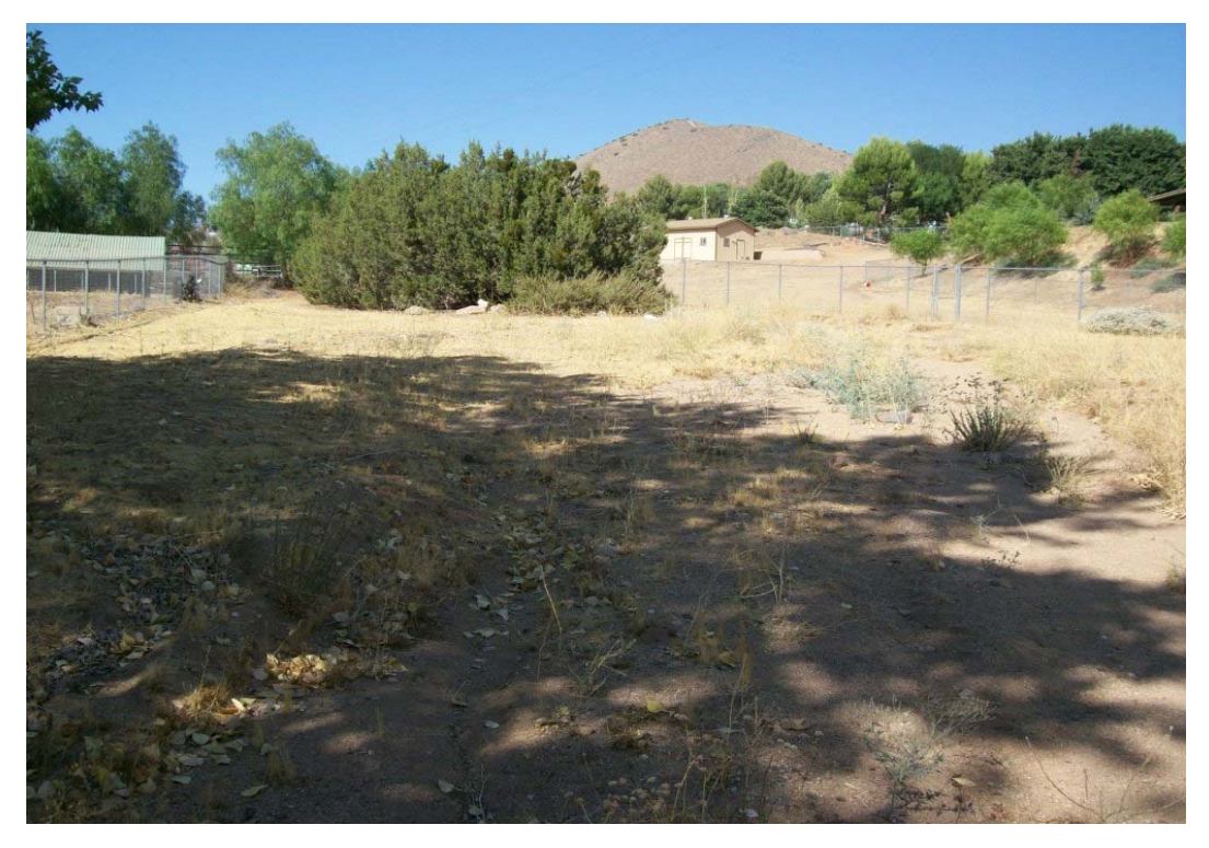
• Cattle Creek Road – Looking upstream at upstream side