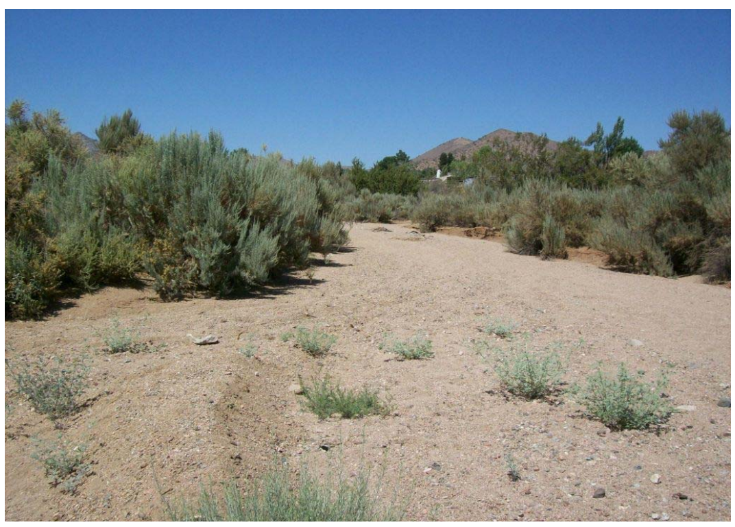
• Soledad Canyon Road - Looking upstream at upstream side