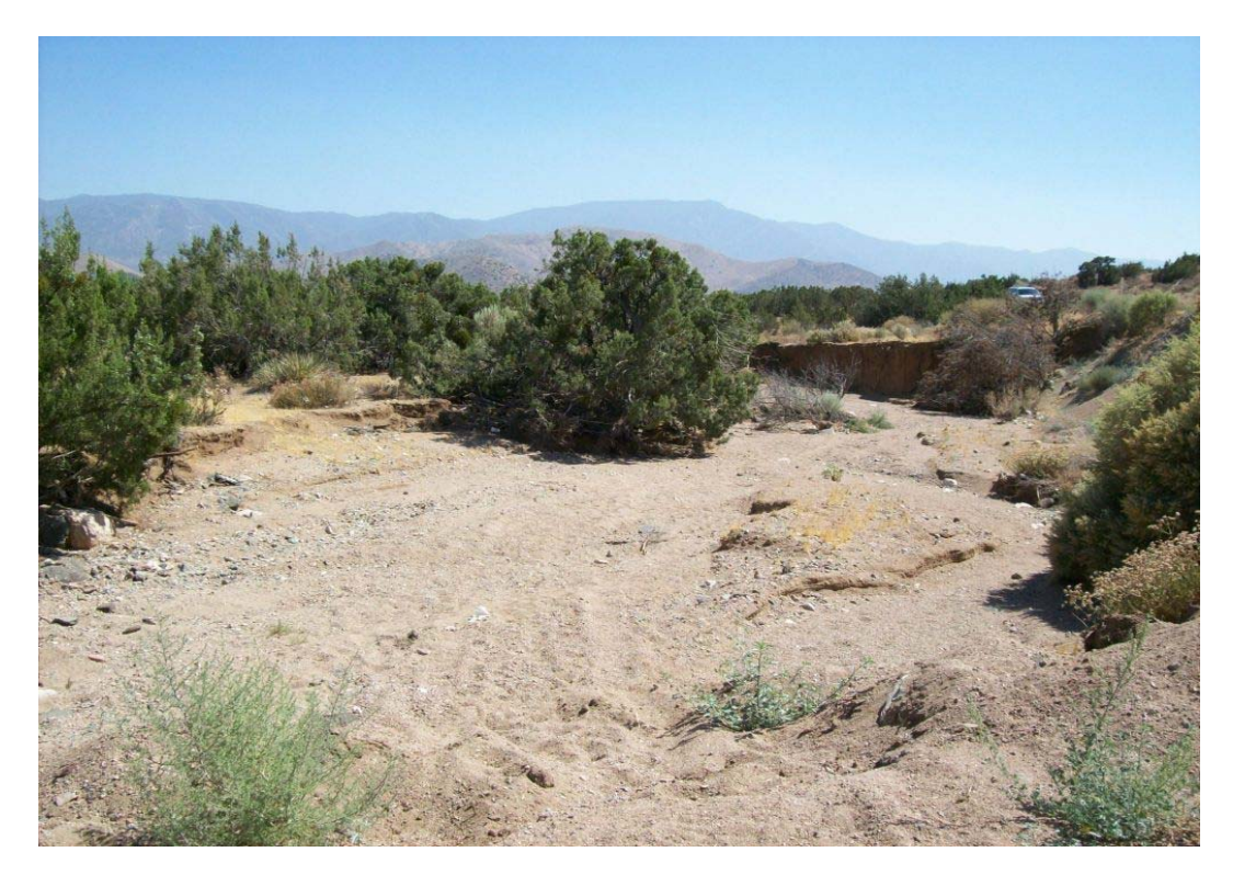
• Santiago Canyon Road – Looking downstream at downstream side