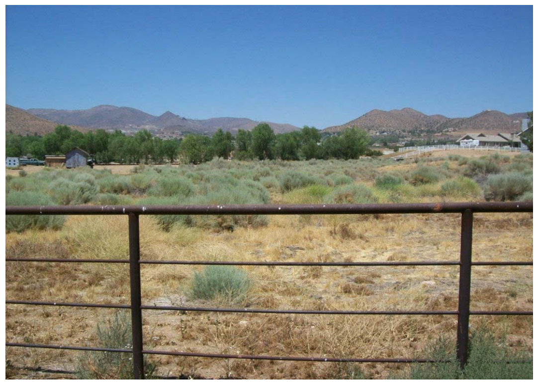
• Aliso Canyon Road – Looking upstream from roadway