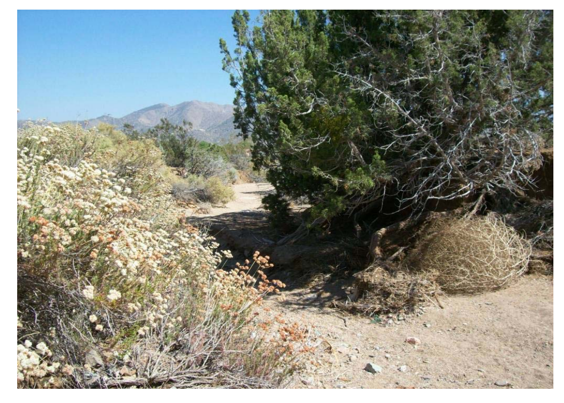
• HWY 14 – Looking downstream at downstream side