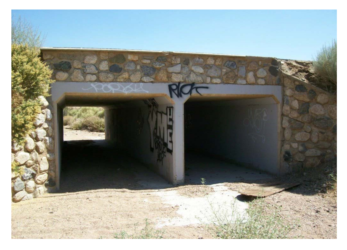
• Soledad Road Crossing – Looking downstream at upstream side