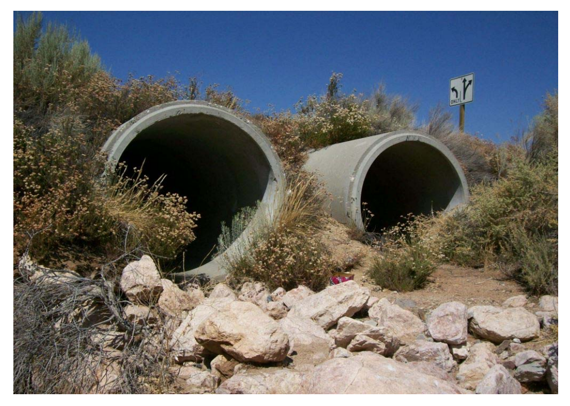
• HWY 14 - Looking upstream at downstream side