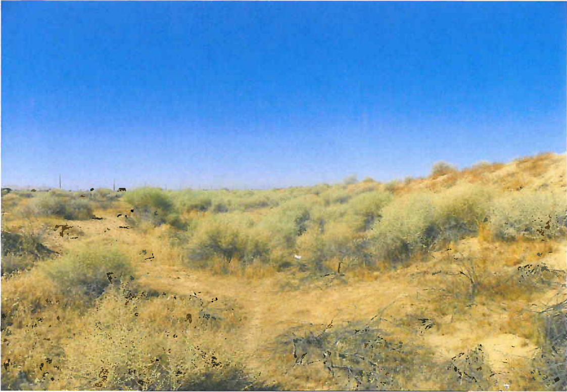
9a. LOOKING UPSTREAM FROM CROSS SECTION 118' UPSTREAM OF BRIDGE