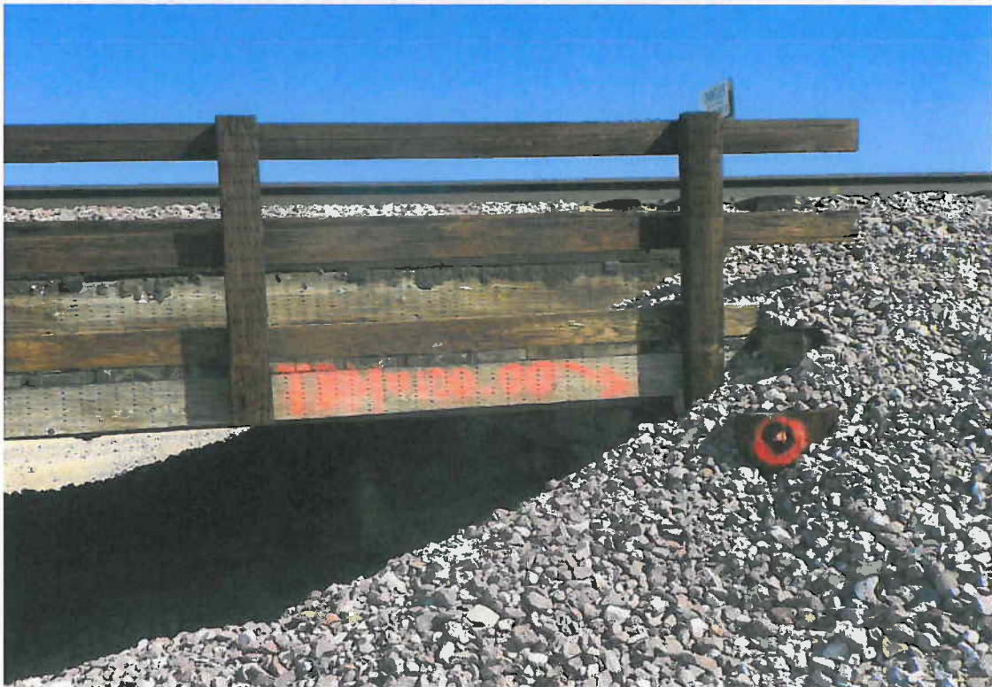
1b. TEMPORARY BENCH MARK LOCATION