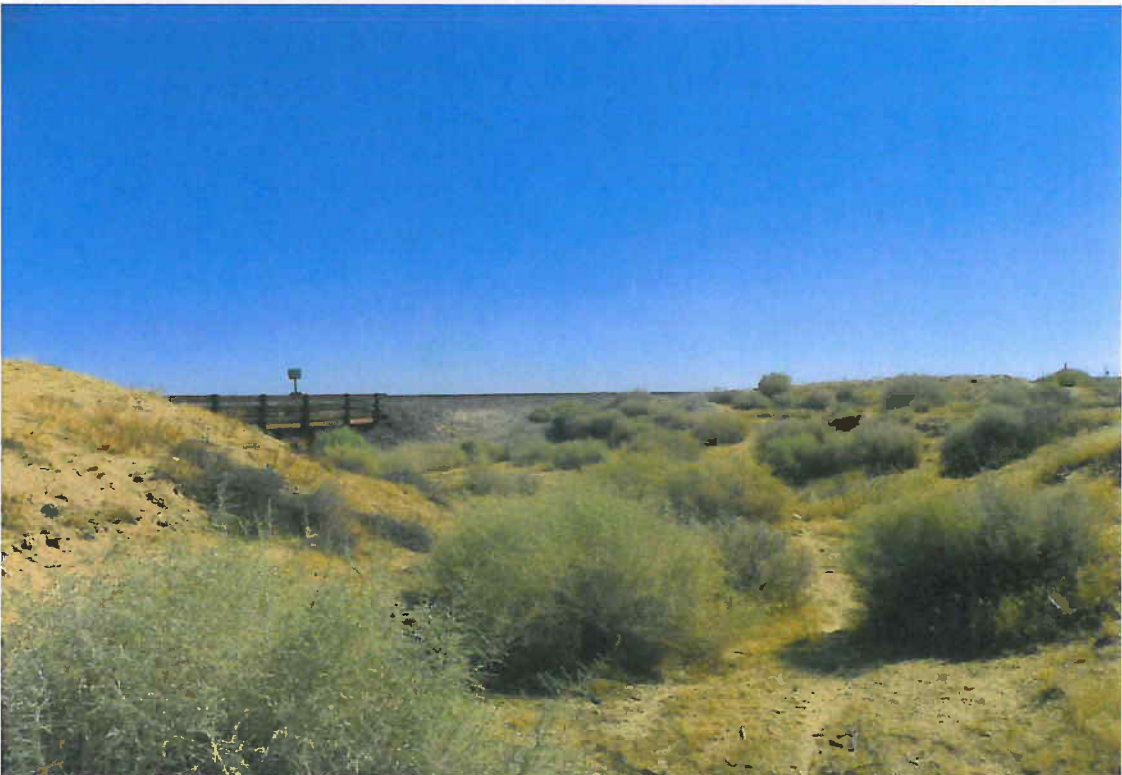
9b. LOOKING DOWNSTREAM FROM CROSS SECTION 118' UPSTREAM OF BRIDGE