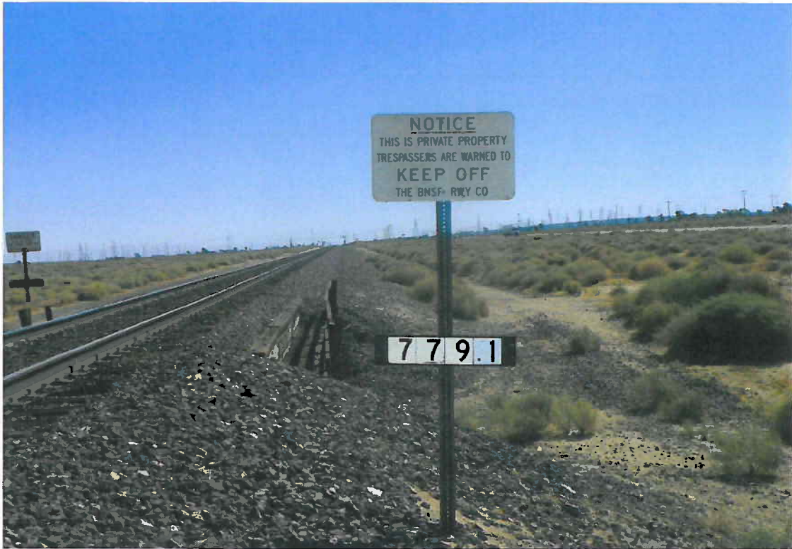
1a. BRIDGE SIGN

BRIDGE 779.1 LS 7200 KRAMER JUNCTION, CA 09/18/2011