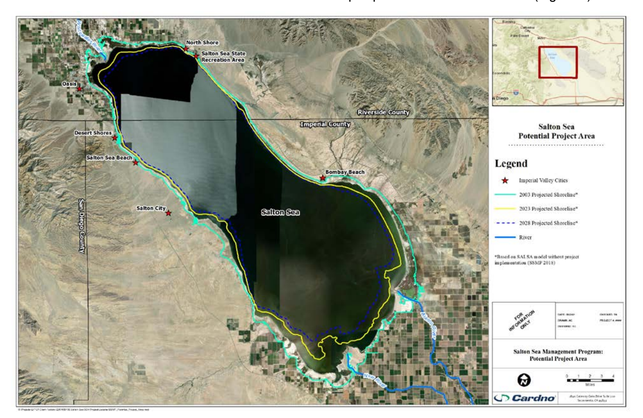
Figure 2-1 Study Area

The Salton Sea, located in southern Riverside and northern Imperial counties in Southern California, is California's largest lake. The Salton Sea lies west of the Chocolate Mountains, west of Salton City, north of Brawley, and south of Mecca, at approximate latitude 33°19'43.03"N and longitude 115°50'36.28"W. The study area for this desktop assessment encompasses the Salton Sea perimeter, which lies between the estimated 2028 shoreline and a 0.5-mile-wide buffer upslope from the 2003 shoreline (Figure 1).