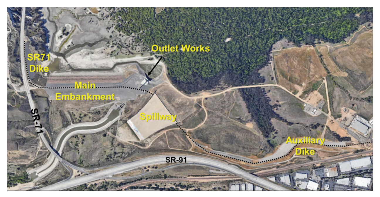
Figure 2: Location of Prado Dam near the intersection of SR 71 and SR 91 in Corona, CA

Funding for the design of the Prado Dam spillway raise modifications was provided by annual appropriations from the original SARM project authority. In October 2018, the Bipartisan Budget Act (BBA) of 2018 (Public Law 115-123), Division B - Supplemental Appropriations for Disaster Relief Requirements, provided funding to complete the remaining elements of the SARM project. Specifically, BBA program funding was requested and received for the design and construction for the Prado Dam spillway raise modifications.