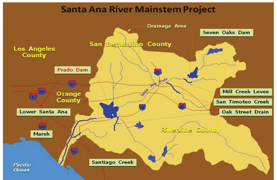
Figure 1 – Santa Ana River Mainstem Project Location Map