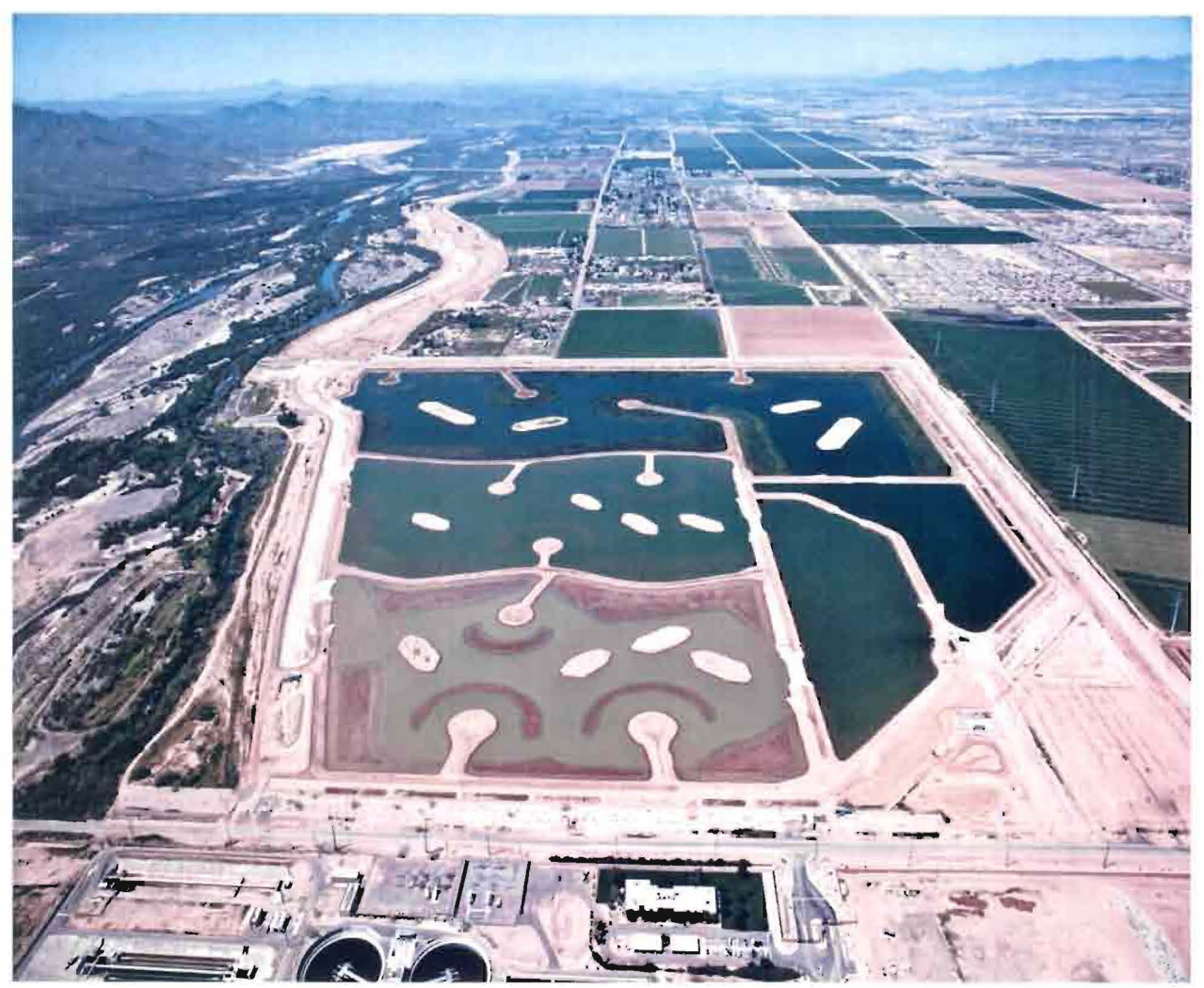
Overall Project View as Constructed features

a. <u>Project Authority</u>. The Project was authorized in accordance with the provisions of Section 101(b)(4) of Water Resources Development Act of 2000 (WRDA 2000), Public Law 106-541 (PL 106-541), and under authority given in Section 6 of Public Law 761, Seventy-fifth Congress, June 28, 1938, which reads in part as follows: